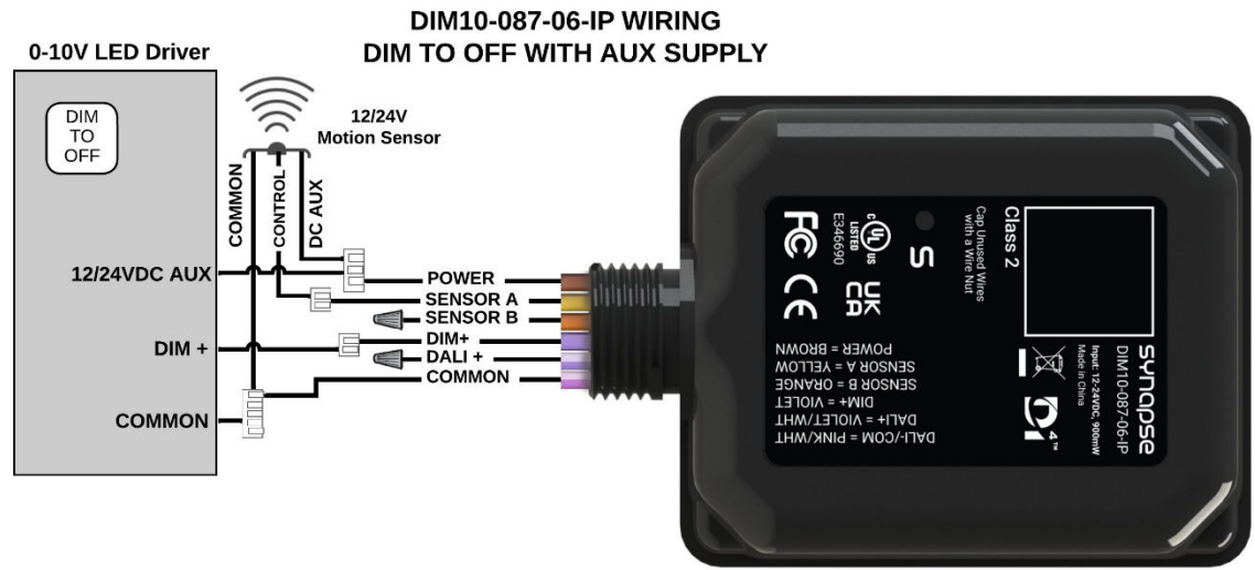
Figure 1 - DIM to OFF Wiring Diagram

For more information on SimplySnap and the DIM10-087-06-IP, refer to the website at http://help.synapsewireless.com/ .