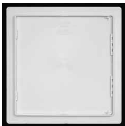
PA-3000 View of door back