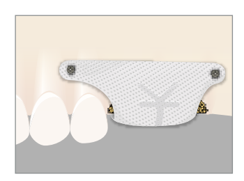
New "T<sup>2</sup>" membranes provide buccal fixation points outside of the defect area.