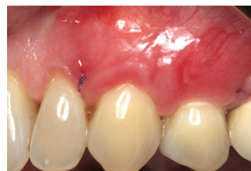
8a. Two weeks post-op