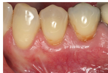
6b. Four months post-op