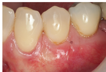
5b. Four weeks post-op