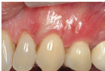
9a. Four weeks post-op