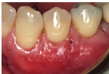
4b. Two weeks post-op