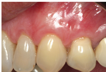
10a. Four months post-op