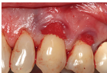
6a. Graft in place