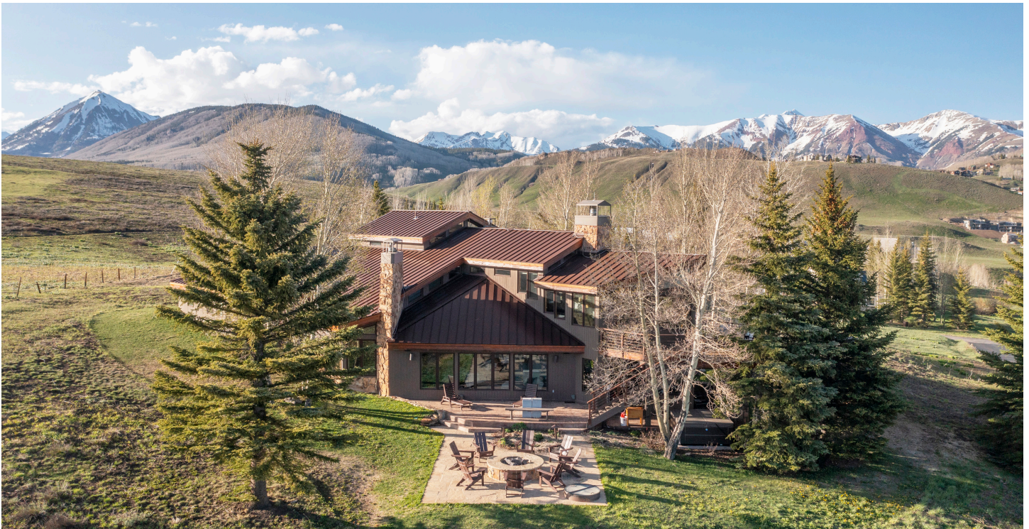
8 Glacier Lily Way | Offered for $4,950,000