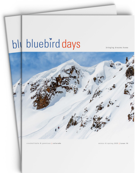
bluebird days magazine