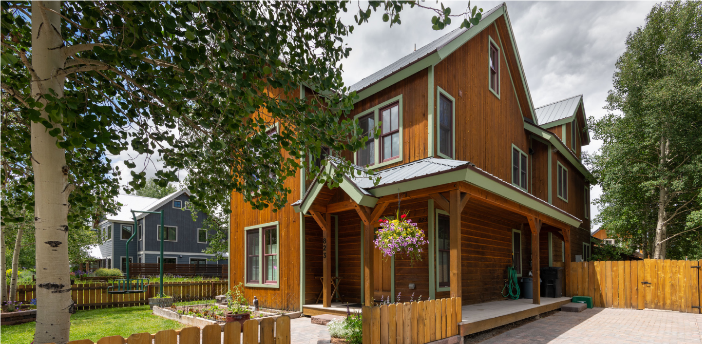
823 & 825 Whiterock Avenue | Offered for $4,270,000