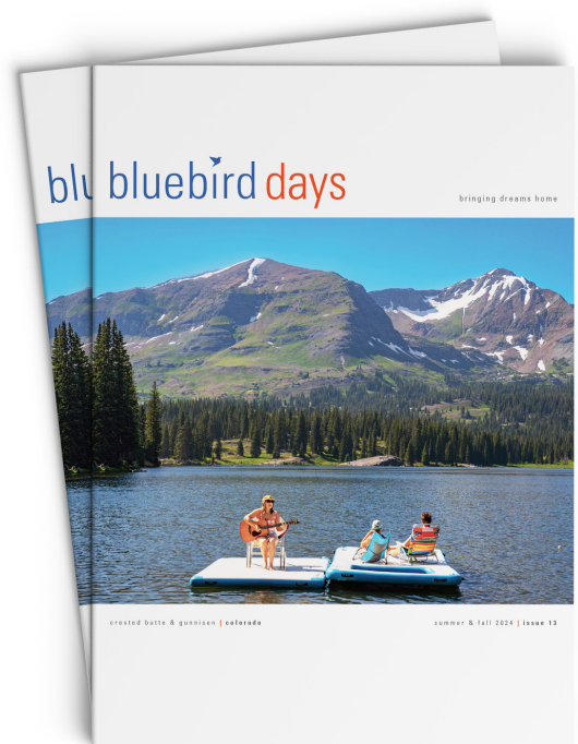
bluebird days magazine