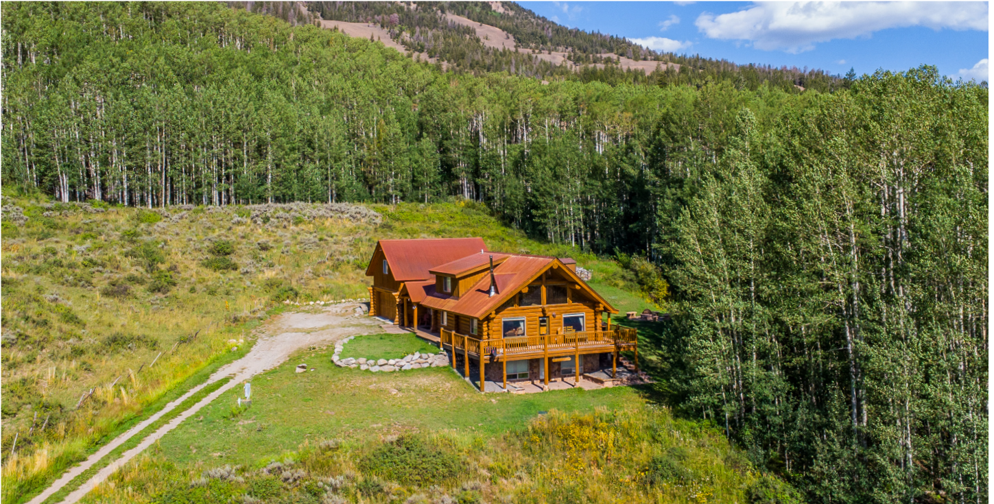
31 Taloga Road | Offered for $1,295,000