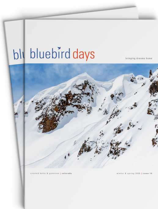
bluebird days magazine