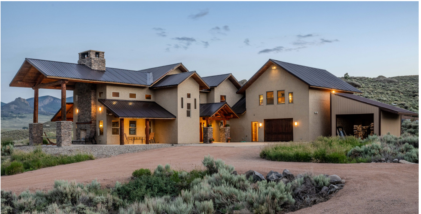
43495 County Road 18W | Offered for $2,300,000