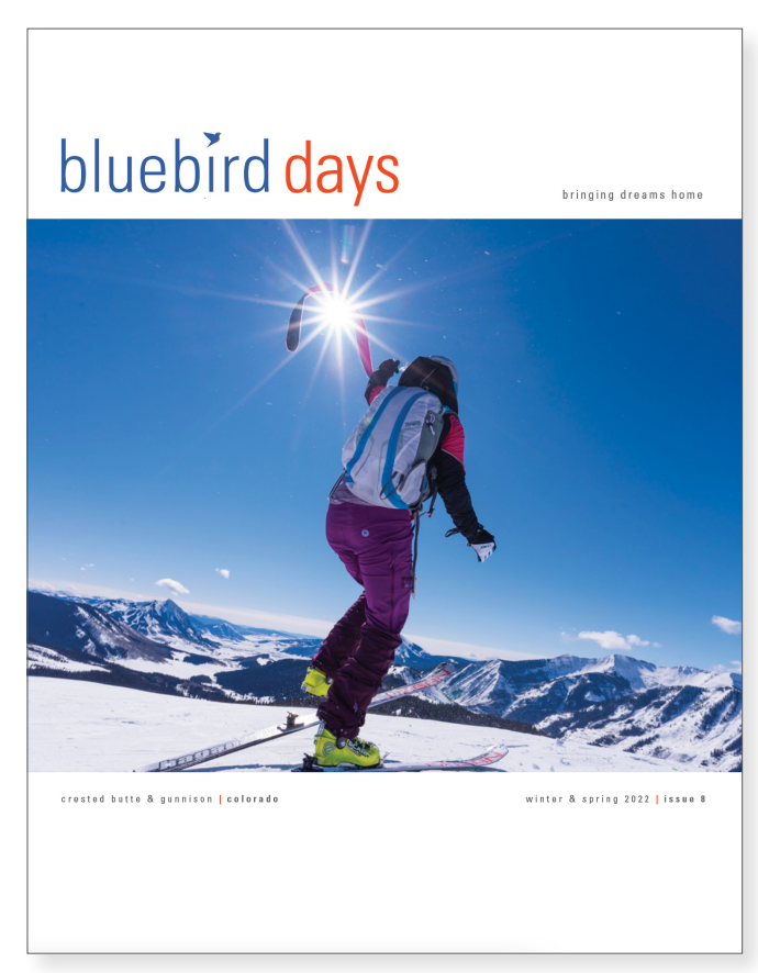
bluebird days magazine