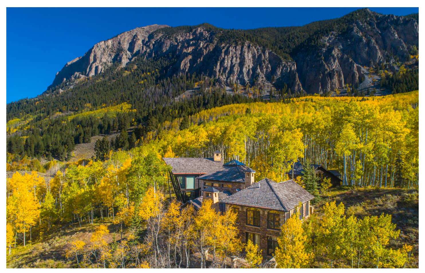
303 Forest Lane | Offered for $9,999,700