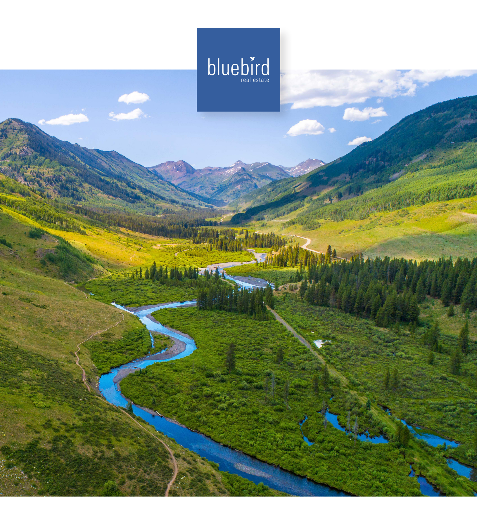
bringing dreams home