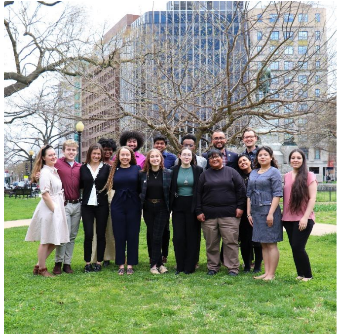
2022 Alumni Ambassador Forum