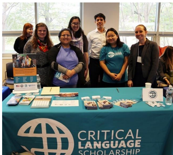
CLC alumni join staff for a study abroad fair