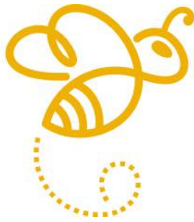
The Queen Bees