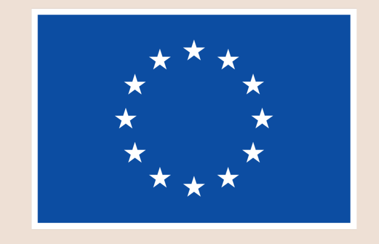
Co-funded by the European Union