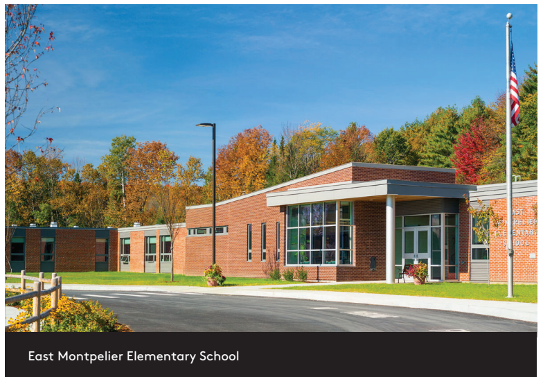
East Montpelier Elementary School

The Vermont Agency of Education (AOE) is partnering with District Management Group to provide DMSchedules for Elementary Schools scheduling software and services to all 247 elementary schools in the state of Vermont. DMSchedules for Elementary Schools software allows schools to quickly and easily build and manage elementary school schedules that incorporate best practices and align to strategic goals. In addition to having access to the cloud-based scheduling software, Vermont's elementary school schedulers have access to DMSchedules' online webinars on scheduling best practices and software training, guides and case studies on scheduling best practices, and scheduling assistance.