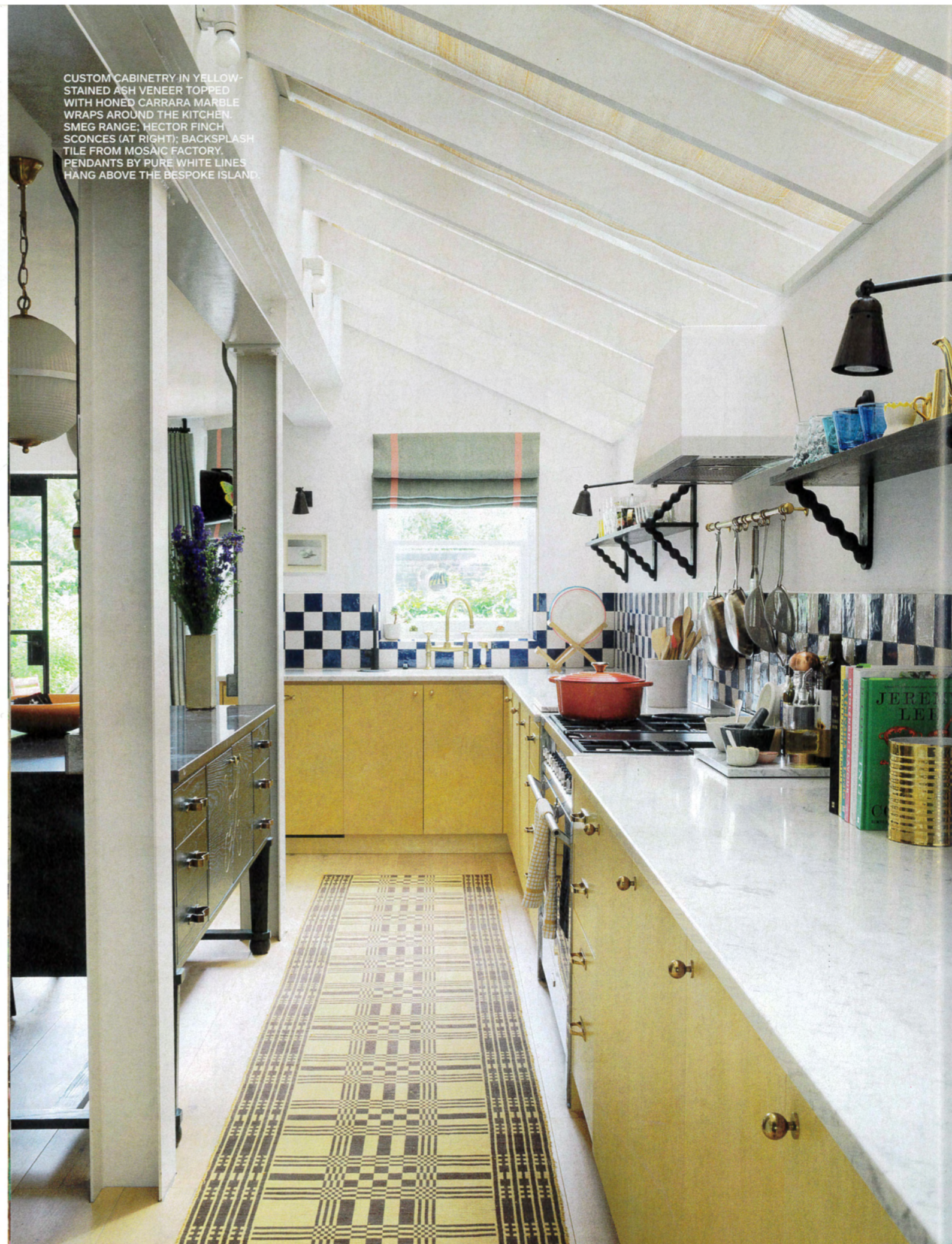
CUSTOM CABINETRY IN YELLOW-STAINED ASH VENEER TOPPED WITH HONED CARRARA MARBLE WRAPS AROUND THE KITCHEN. SMEG RANGE; HECTOR FINCH SCONCES (AT RIGHT); BACKSPLASH TILE FROM MOSAIC FACTORY. PENDANTS BY PURE WHITE LINES HANG ABOVE THE BESPOKE ISLAND.