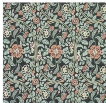
ON THE VINE Garden Guild wallpaper by Schumacher, to the trade, schumacher.com