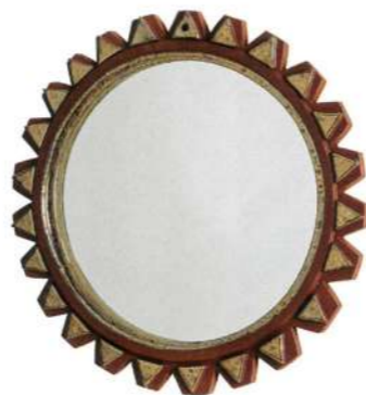
REFLECTIVE POWER Rayons Wall Mirror by Dumais Made, $2,800, dumaismade.com