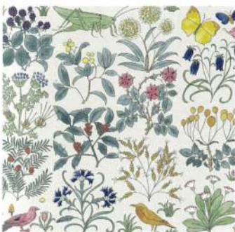
CALL OF NATURE Apothecary's Garden wallpaper by C.F.A. Voysey, $187 per roll, charlesvoysey.com