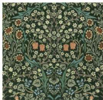
THORNY ISSUE Blackthorn wallpaper by Morris & Co., to the trade, morrisandco.sandersondesigngroup.com