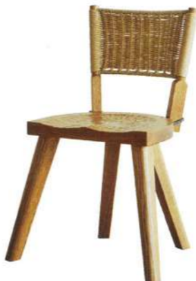
WOVEN THROUGH Cord Back Four Leg Chair by Furniture Marolles, $2,750, nickeykehoe.com