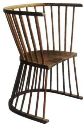
REVERSE COURSE Flip Chair by Howe London, $1,930, howelondon.com