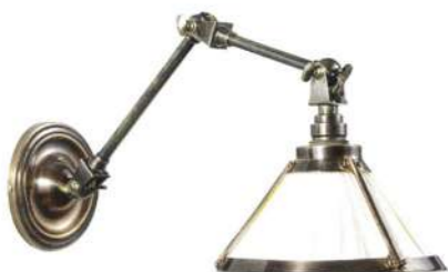
COMPLETELY RIVETING Venetia Double Arm Wall Light by Hector Finch, to the trade, hectorfinch.com