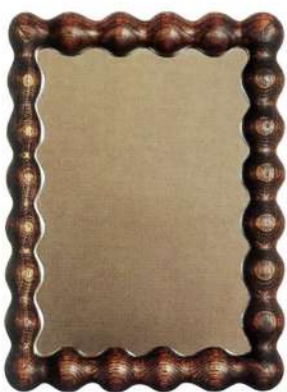
TAKE A TURN Bobbin Mirror by Cutter Brooks, from $340, cutterbrooks.com