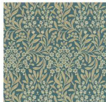
LEAFY GREENS Kryddhyllan wallpaper by Boråstapeter, to the trade, schumacher.com