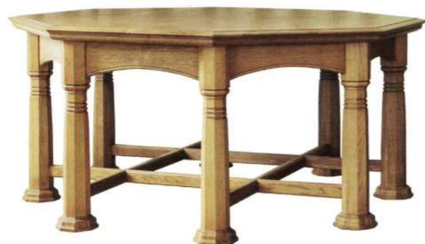
OCTAGONAL STATEMENT Bexley Table by Jamb, $31,600, jamb.co.uk