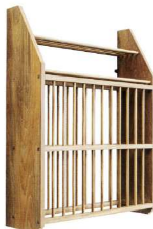
OFF THE RACK Plate Rack by Jamb, $3,500, jamb.co.uk