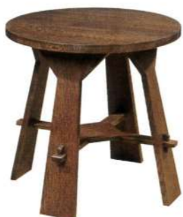
STRETCHING OUT Gus Tea Table by Stickley, to the trade, stickley.com