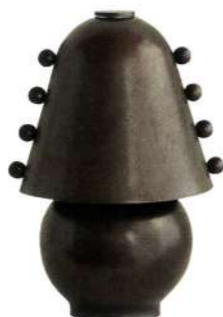
PATINA PERFECT Small Brass Gemma Table Lamp by In Common With, $1,750, incommonwith.com