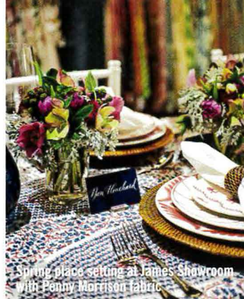
Spring place setting at James Showroom with Penny Morrison fabric