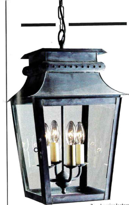
Zeus hanging lantern

Our COVID silver lining was the opportunity to move our headquarters into a building that formerly housed fine art and antiques auctioneers, which closed during the pandemic. We were able to fit out the sale room as a modern, warm, and spacious warehouse and converted the former furniture store into a purpose-built production workshop with an expanded engineering department and line of wiring benches. This facility, along with lovely offices, has transformed our working environment, as well as made us much more efficient and able to produce more custom fittings than previously. We added three new showrooms in North America during 2020 and have a dedicated Hector Finch space at Harbinger LA and a greatly expanded display in Chicago and Dallas. I'm also in conversation with a new showroom opening in Nashville.