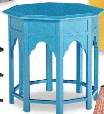
Tanjina side table; williamyeoward.com