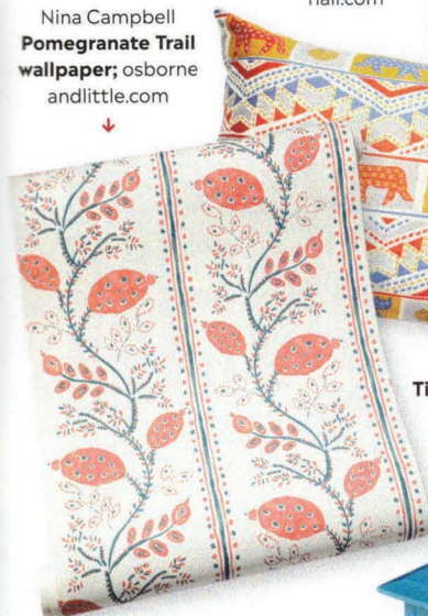
Nina Campbell Pomegranate Trail wallpaper; osborne andlittle.com