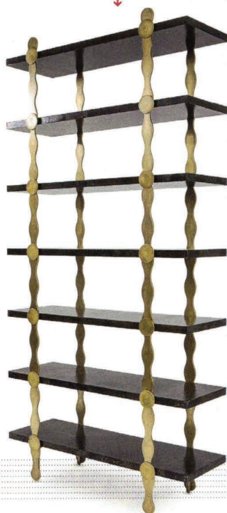
Daisy bookcase; julianchichester.com