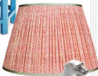
Floral Silk lampshade; pennymorrison.com