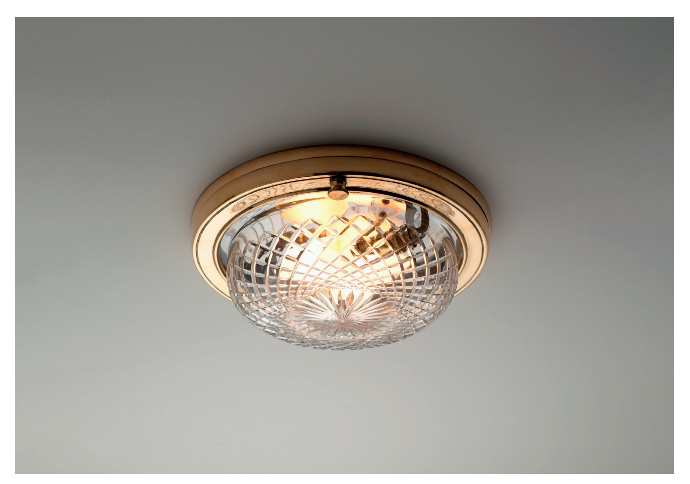
PRODUCT CODE CL01