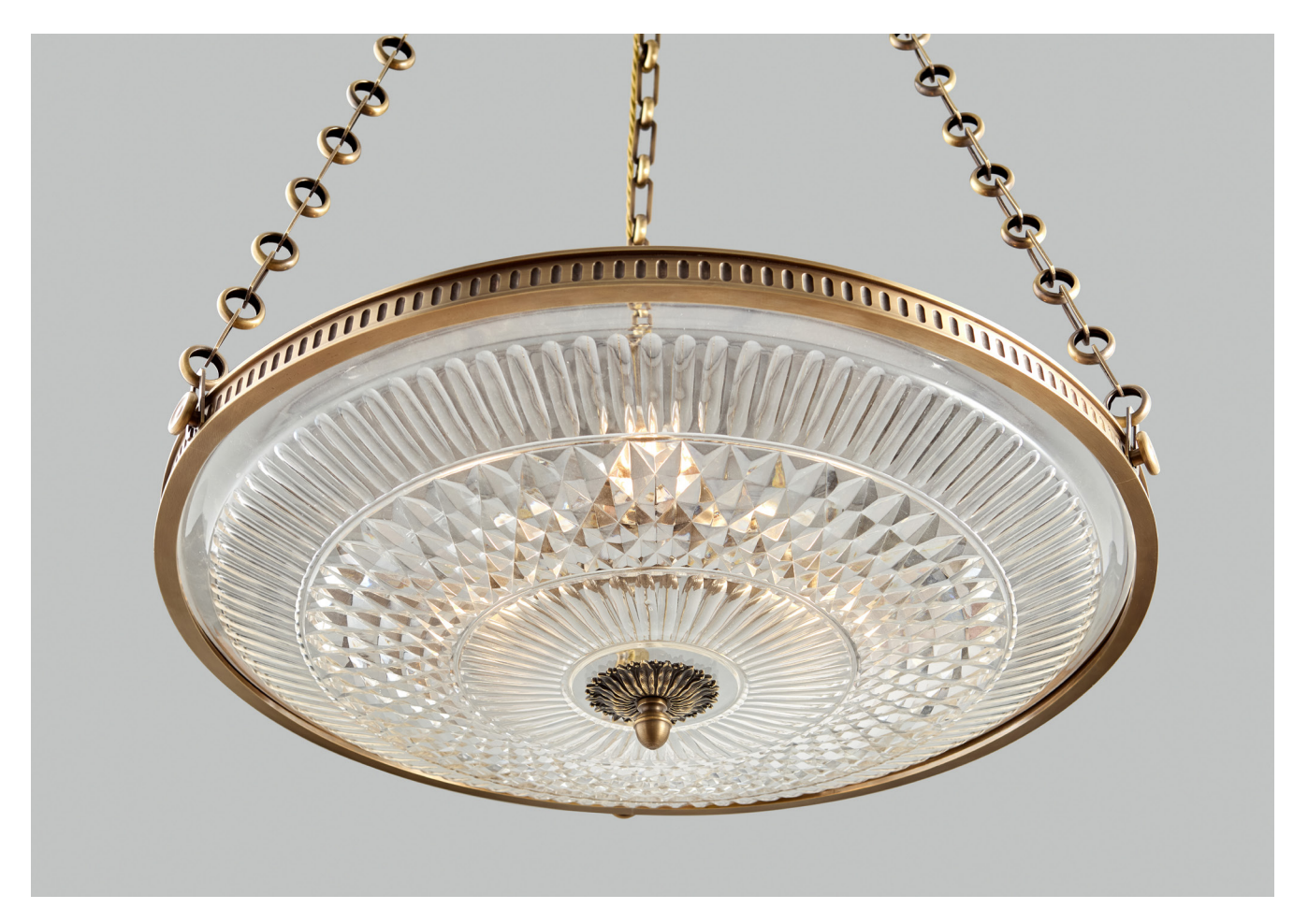
PRODUCT CODE PL356