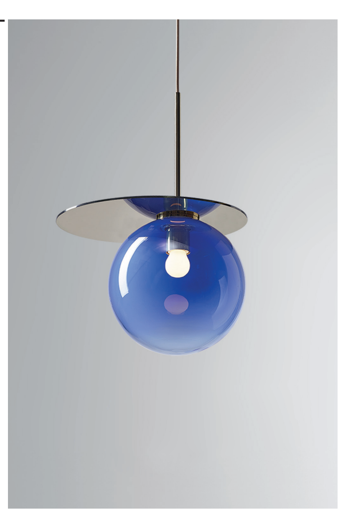
PRODUCT CODE PL410 CATEGORY: CHANDELIERS & PENDANTS