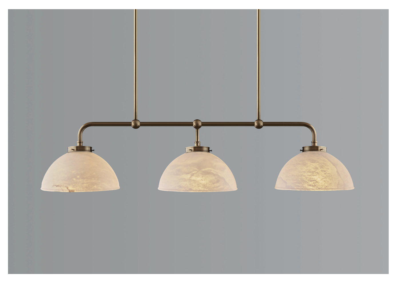
PRODUCT CODE PL444