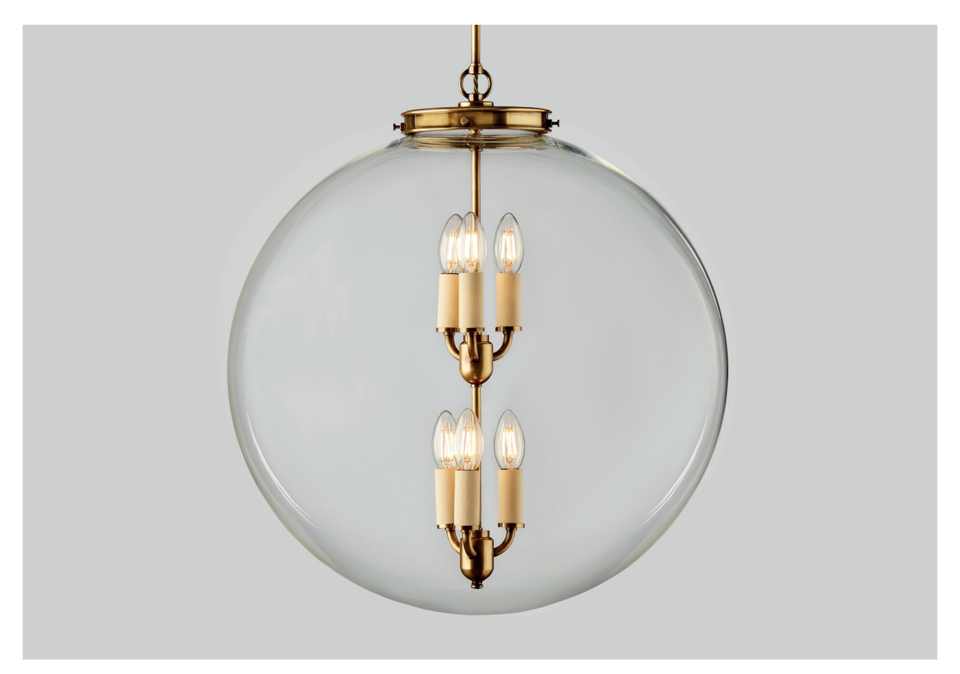
PRODUCT CODE PL85GT