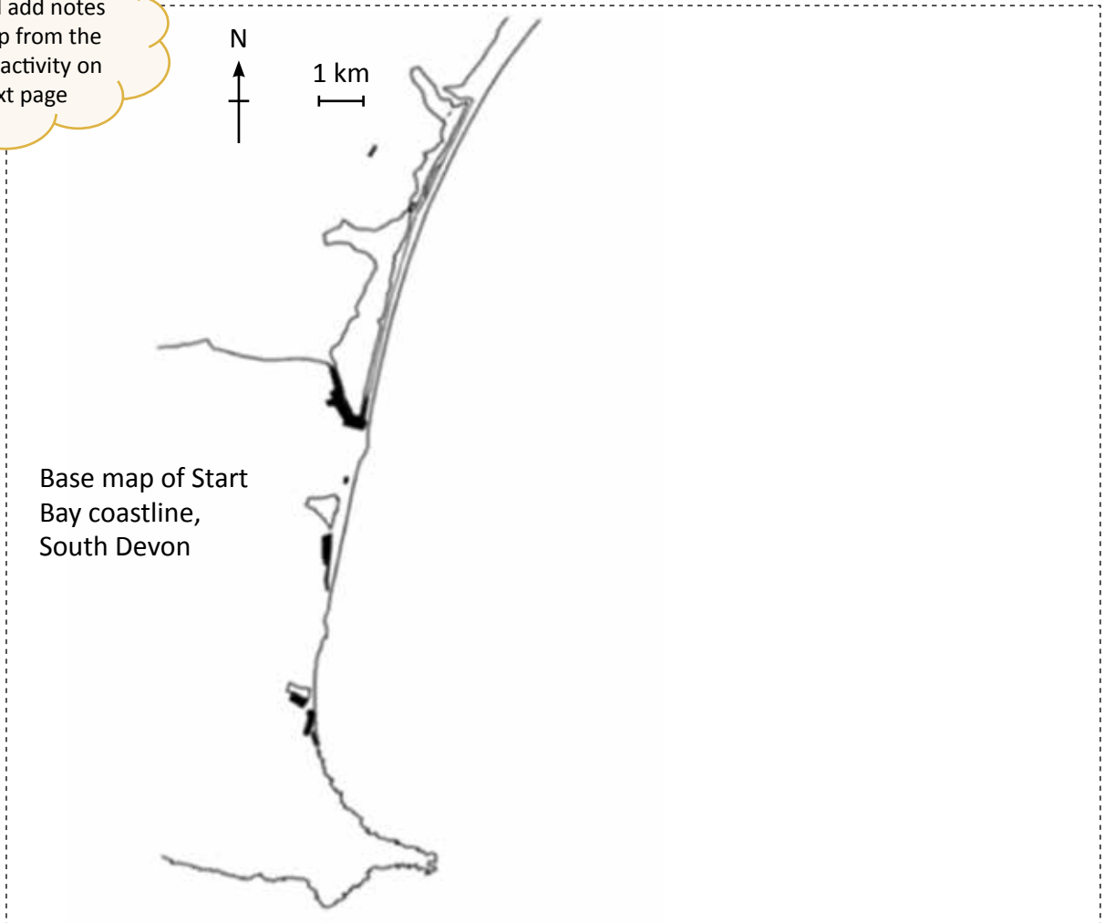
Base map of Start Bay coastline, South Devon

You should add notes to this map from the StoryMap activity on the next page