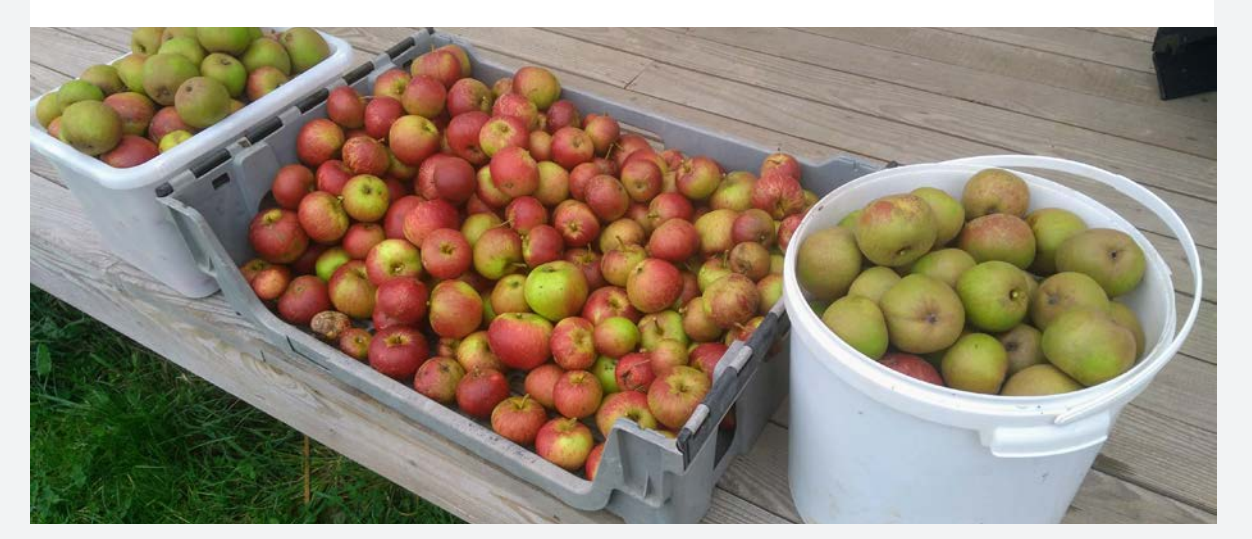
Apples from Rhiw Las

This new report explores some of the opportunities and challenges provided by the unique Welsh legal and policy context, as well as highlighting just some of the leadingedge work being undertaken across Wales, from the structural to the hyper-local. We finish by framing some of the questions we argue that political parties should be responding to when they make their manifesto commitments ahead of Senedd elections in May 2021.