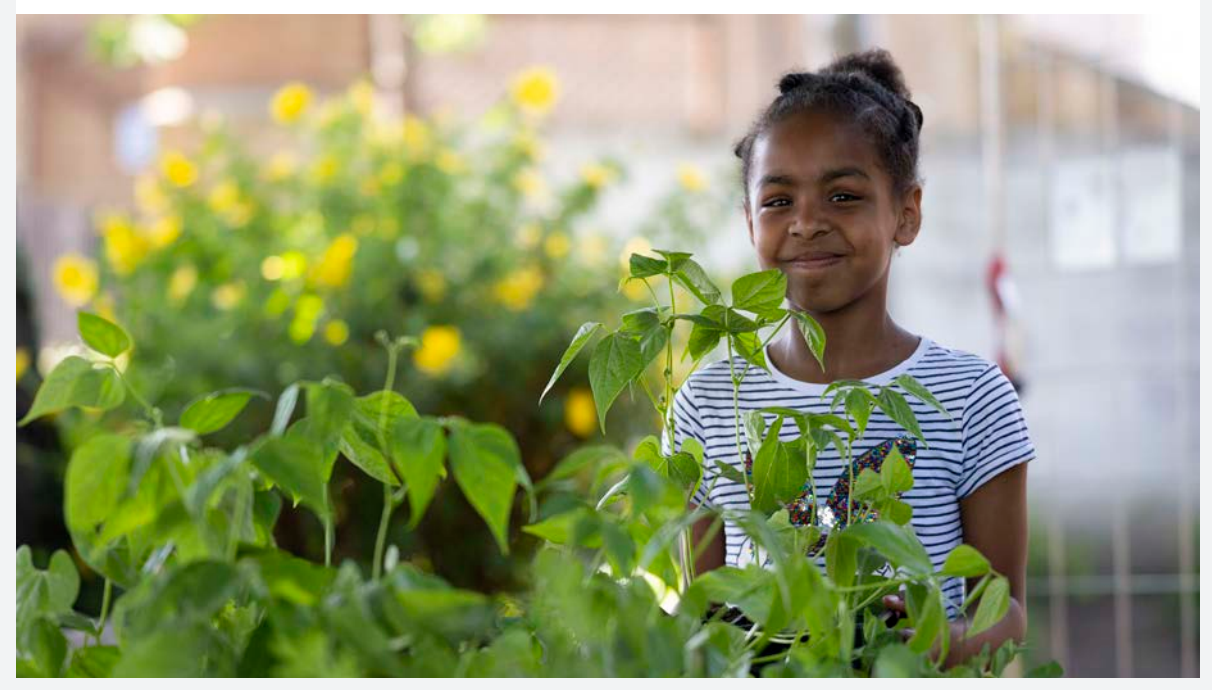
Food Cardiff - Riverside