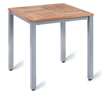
Fig 02 Slatted Teak table top with Aluminium frame.

Teaks' high oil content means that any further wood treatments such as varnish or oil should not be necessary. 'Teak Oil' will not extend the life of the furniture. However be aware that without treatment Teak will naturally age to a silver colour.