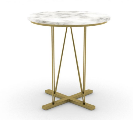
Fig 03 Tron table base with White Carrara Marble table top.

Cleaning should be done with a cloth and warm soapy water. Stubborn marks and pigment type staining can be removed with bleach solutions or white spirit. Acid etching cannot be removed, although can fade with time and develop patina.