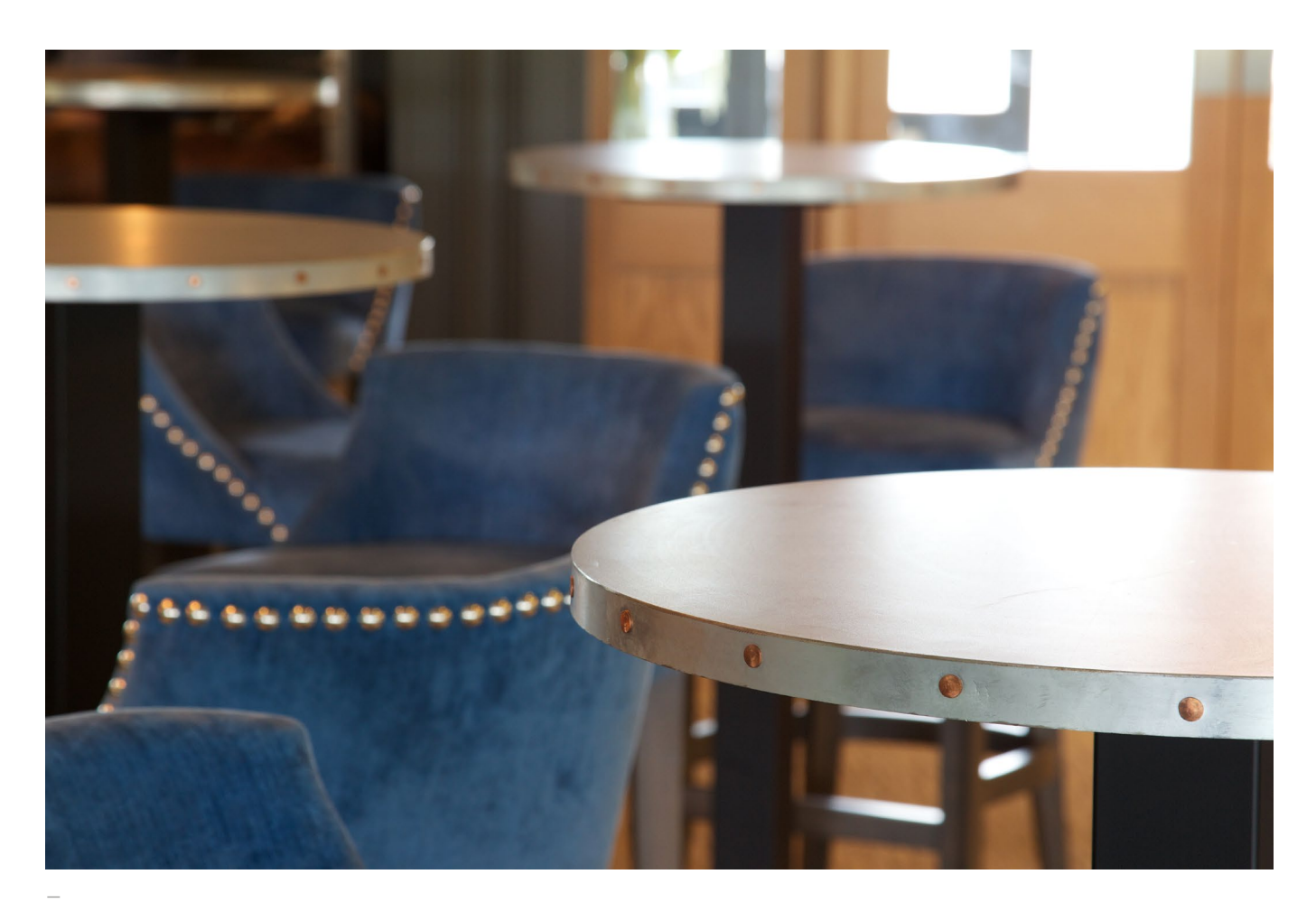
Zinc table top with copper studding.