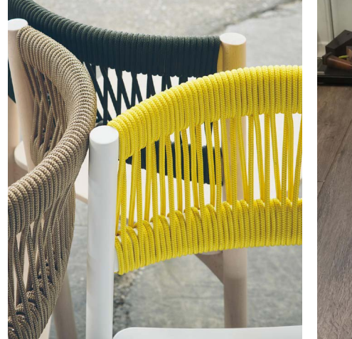
Rope backrest of the Lima collection