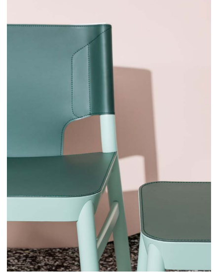
Hide only Timpani chair and stool

Hide - an emerging design trend stemming from seventies furniture design, hide only upholstery includes no filling at all and therefore does not require FR treatment.