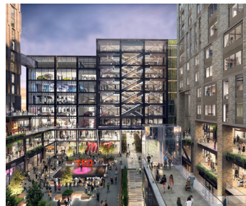
The Fourth Mile