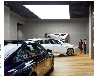
Genesis Studio, London