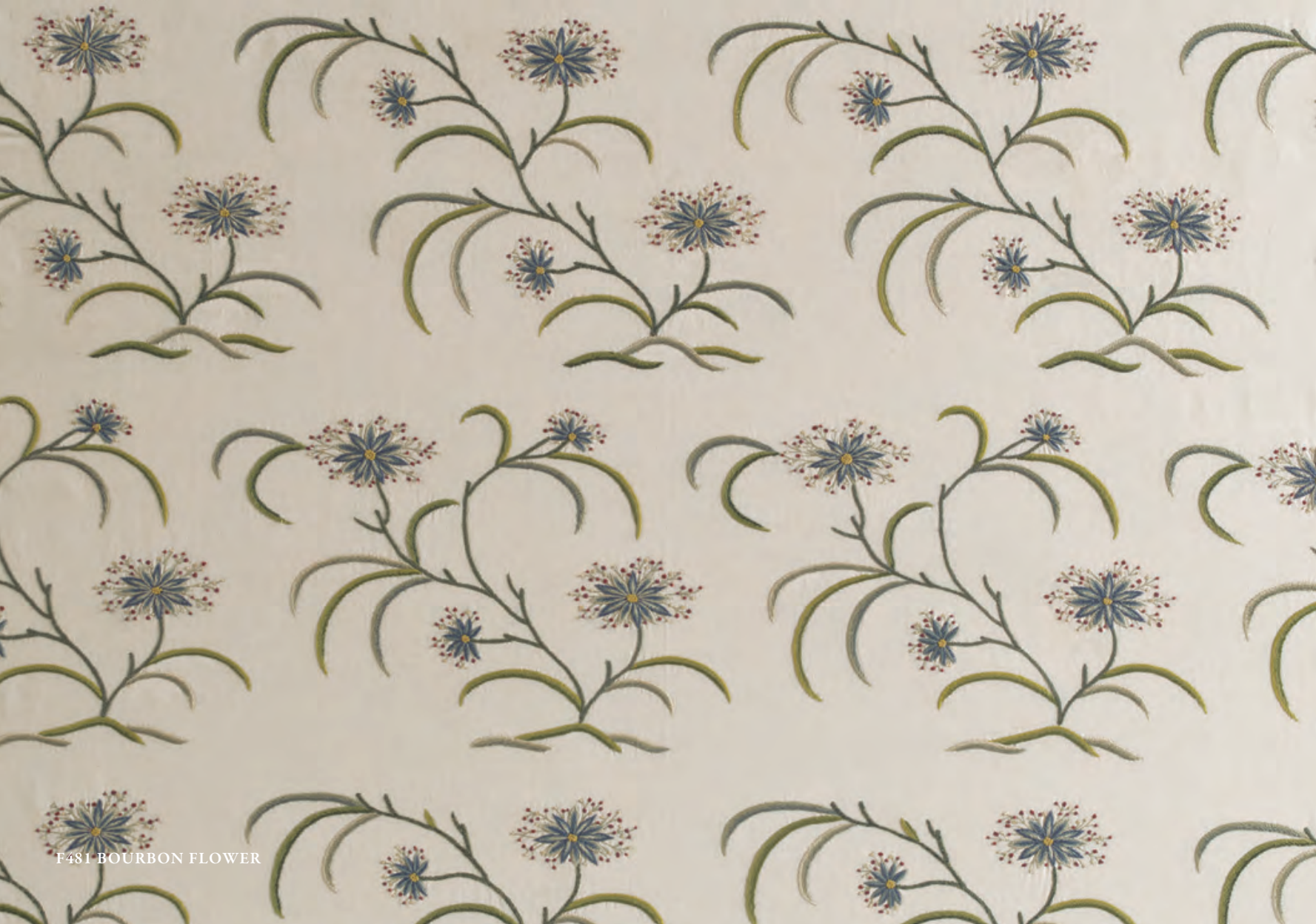
F481 BOURBON FLOWER