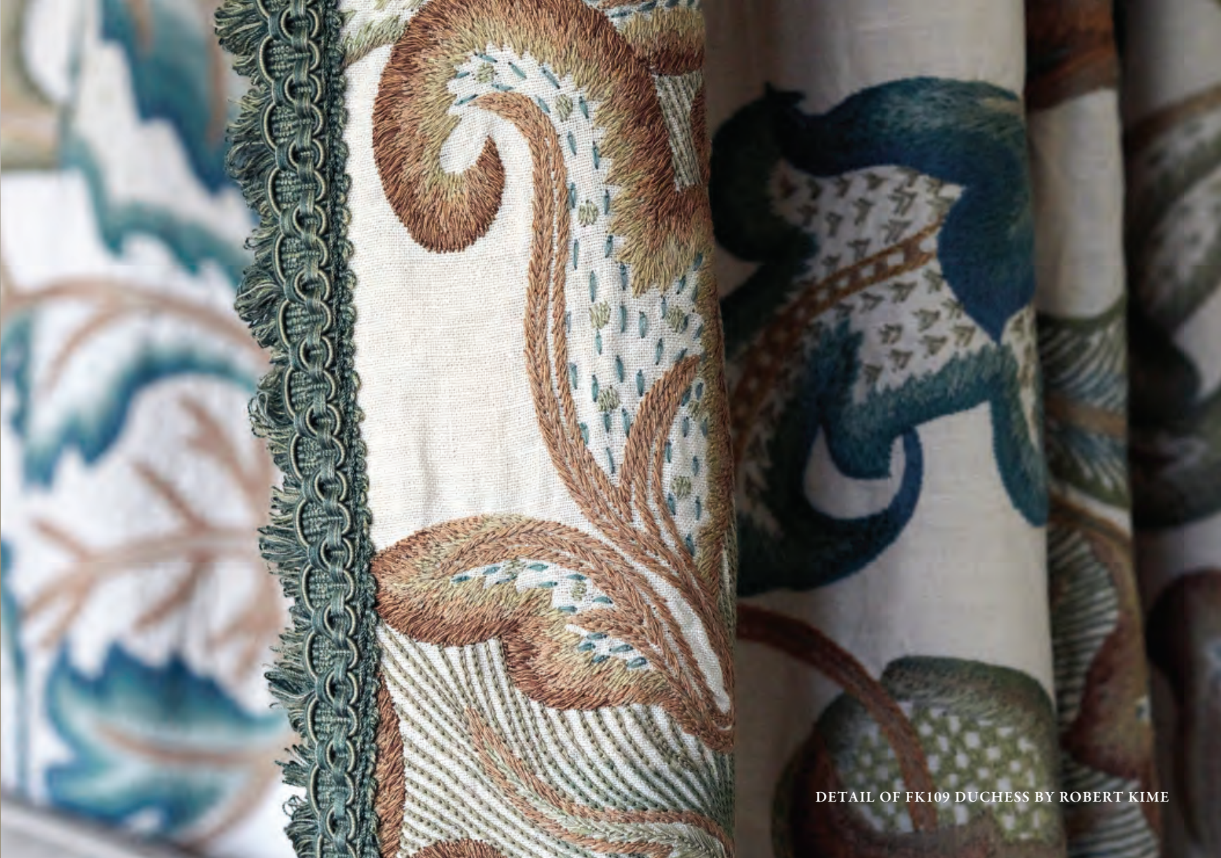
DETAIL OF FK109 DUCHESS BY ROBERT KIME