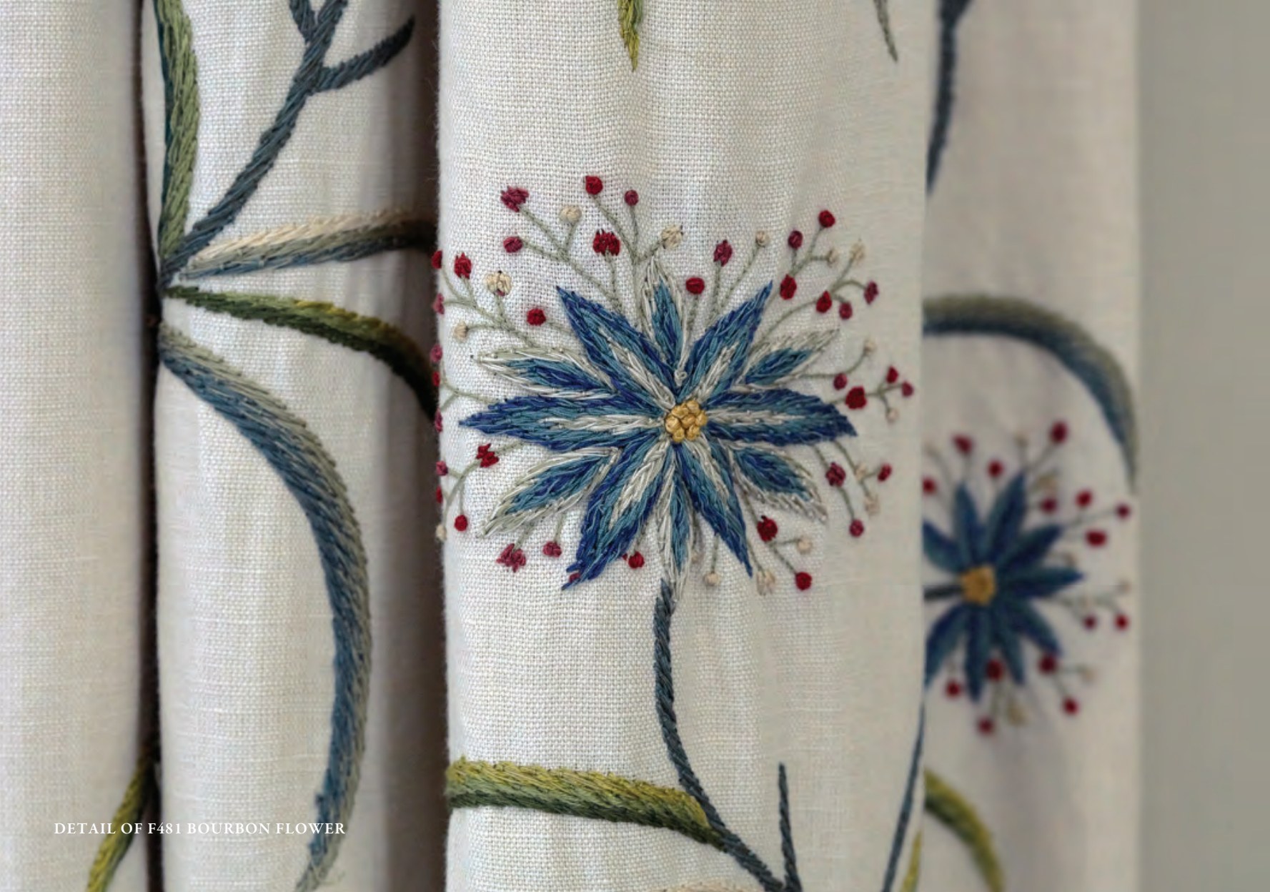
DETAIL OF F481 BOURBON FLOWER