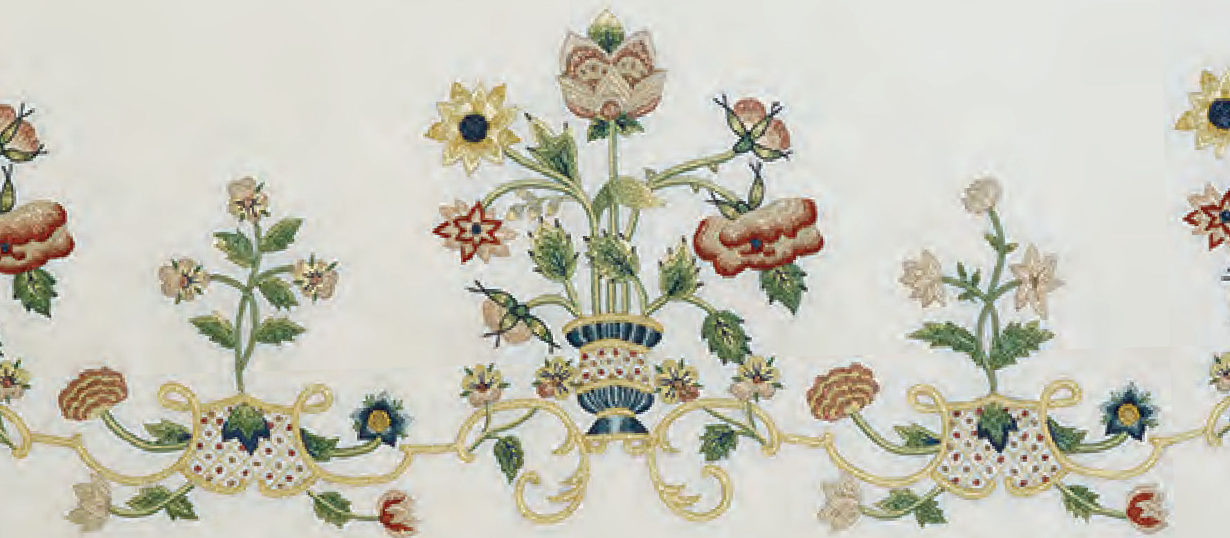
B316 MEADOW FLOWERS TRELLIS BORDER