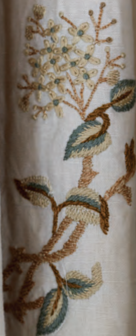
DETAIL OF F469 ASTRID