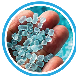
One-piece polyethylene construction