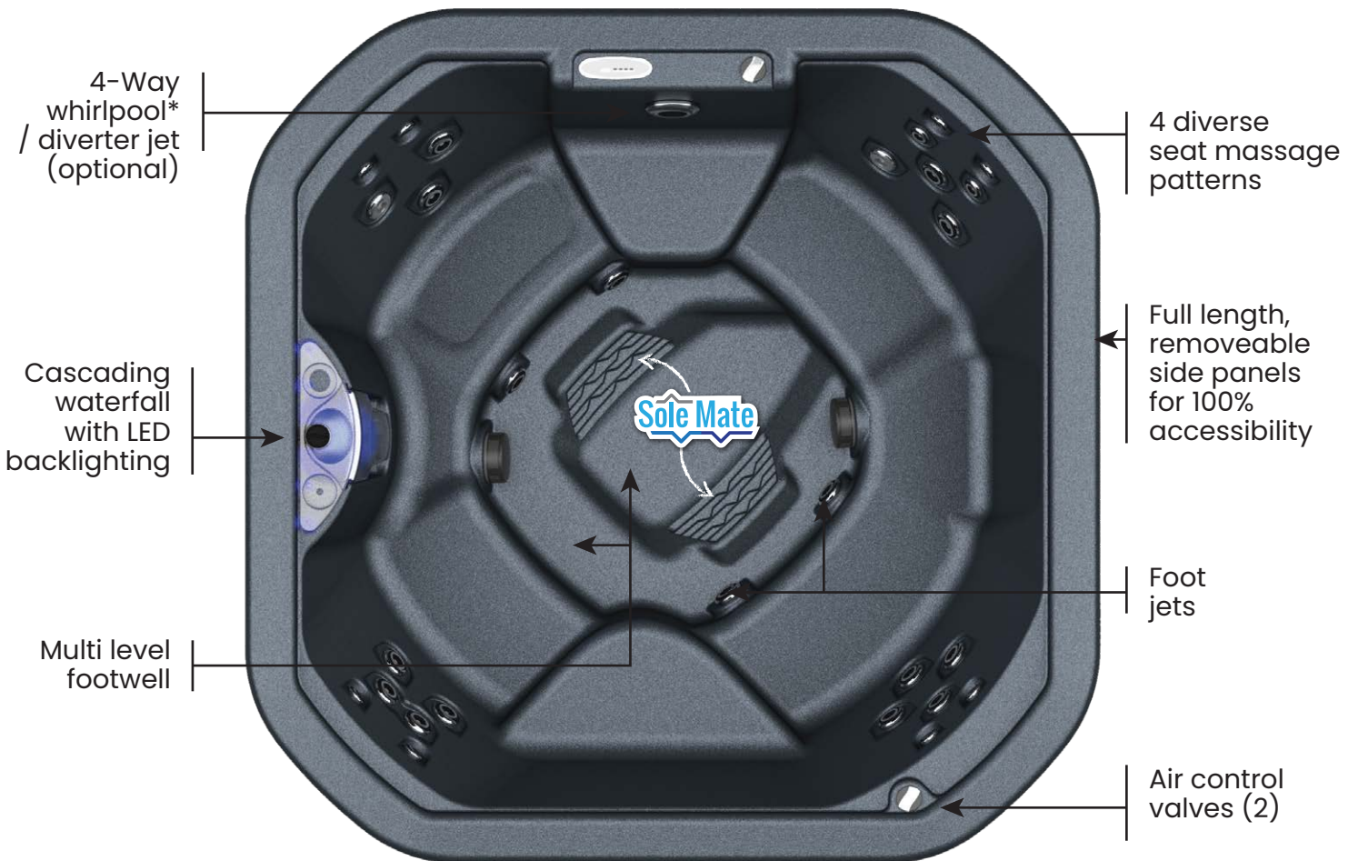
Image for reference only. Colors, specifications and location of the whirlpool* jet may vary (optional).