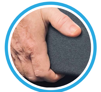
Integrated transport handles