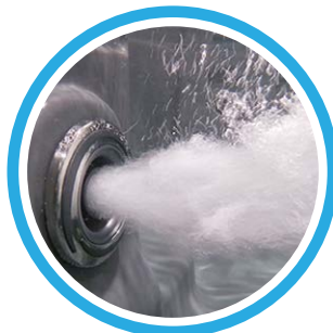
Intense whirlpool* jet action