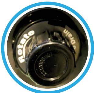
External drain valve

Image for reference only. Colors, specifications and location of the whirlpool* jet may vary (optional).