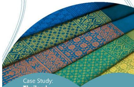
Case Study: Thailand