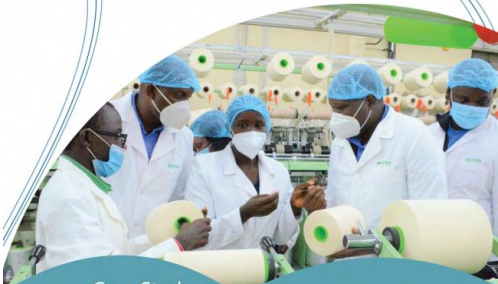
Case Study: Kenya