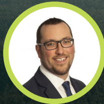
London & South East