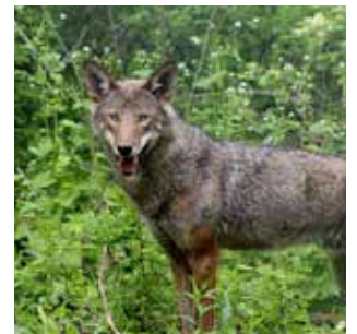
American red wolf

Responding to an urgent call to keep American red wolves from going extinct, we began transforming part of our land in Franklin County, Mo., into a conservation habitat for these critically endangered species in 2021. This dedicated 20-acre space within our 355-acre Saint Louis Zoo Sears Lehmann, Jr. Wildlife Reserve will allow up to 12 mating pairs of wolves to breed in a private, protected natural setting. Each breeding pair will have their own designated habitat. The wolves will come from other conservation organizations as early as 2022. This facility will not be open to visitors — we want the wolves to learn natural survival skills without much human interaction in the secured facility.