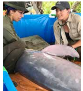
Bolivian river dolphin rescue