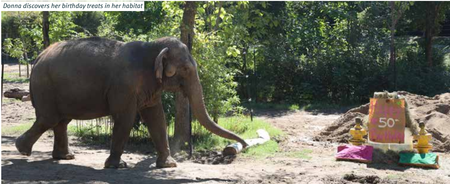
Donna discovers her birthday treats in her habitat