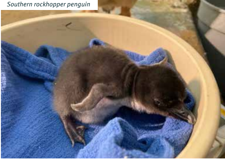
Southern rockhopper penguin