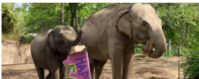
Ellie (and daughter Priya) open birthday treats

Three members of our Asian elephant herd — Ellie, Pearl and Donna — turned 50 in 2021! To give you a little background on these Asian elephants: Ellie is mom to Priya, Maliha and Rani; Pearl is mom to Raja (our male Asian elephant); and Donna is a beloved auntie to the younger elephants.