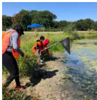
A family explores nature at the Saint Louis Zoo WildCare Park

Although the Saint Louis Zoo WildCare Park is a quiet, vast landscape compared to the Saint Louis Zoo, it is still busy with activity. Members of our team began