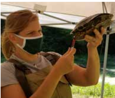
A blood sample being collected from a red-eared slider turtle

In September 2021, the Saint Louis Zoo Institute for Conservation Medicine (ICM) team celebrated 10 years of helping to ensure healthy animals and healthy people. The ICM is made up of experts in veterinary medicine and conservation biology. Their work involves wildlife conservation, public health and helping to ensure sustainable ecosystems — all three are interconnected and affect each other.