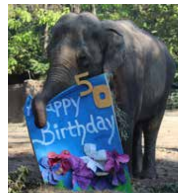
Pearl with her birthday treats