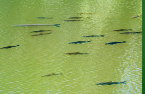
Físheríes Restoratíon on the Alabama Ríver