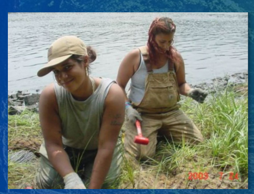
Salt Marsh Restoration at Concrete Plant Park, Bronx River

Water trails provide opportunities for communities to develop and implement strategies that enhance and restore the health of local waterways and surrounding lands.