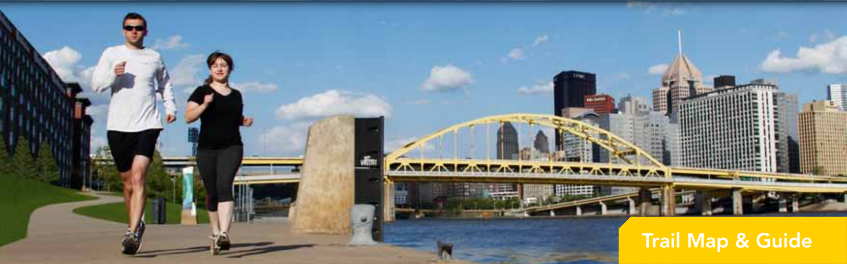
Trail Map & Guide