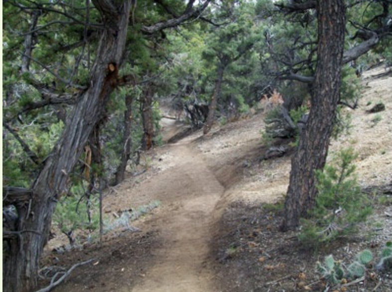
A re-routed section of the trail.