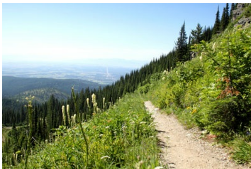
View of Flathead Valley from the trail.