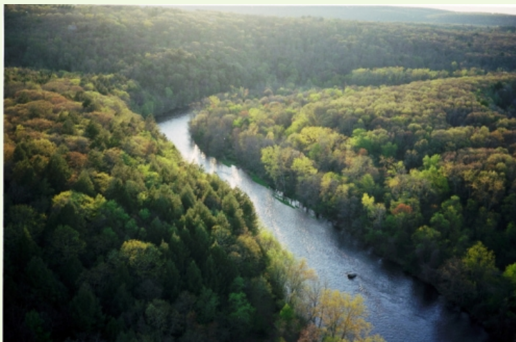
Shetucket River Water Trail, Connecticut