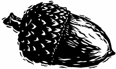
The Acorn Group

Check out our volunteer portal and training calendar for upcoming conferences and events.