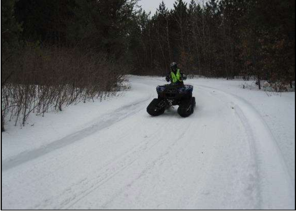
Photo 22: OHV 1 (Yamaha ATV) – fast/aggressive curve pass-by approach at site #2

Photos 22 through 26 below show a series of aggressive passes through the winding trail at test site #2; all vehicles left minimal impressions on the trail's surface, as outlined in Table 3-3 on page 31.