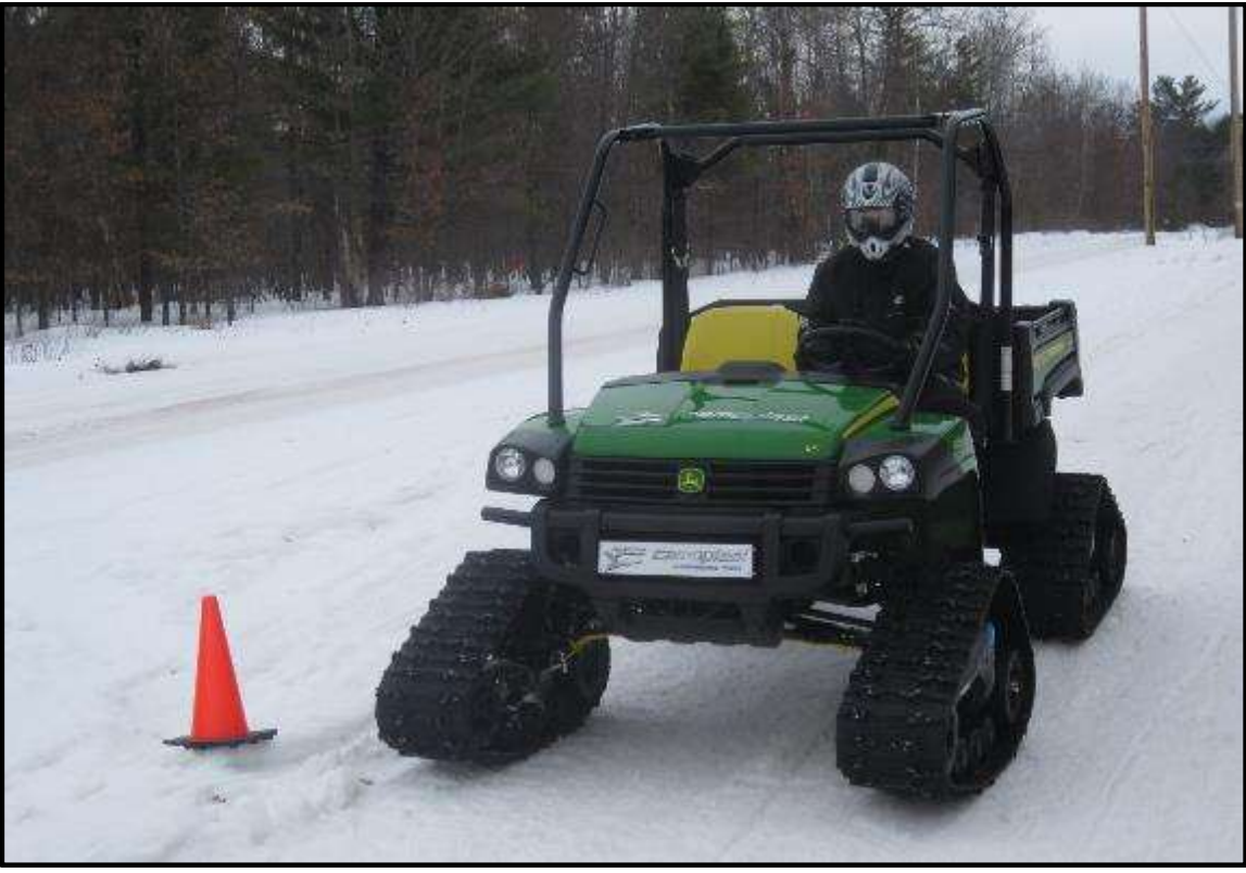
Photo 9: OHV 3 (UTV) – John Deere Gator 825i with Camoplast tracks, front view