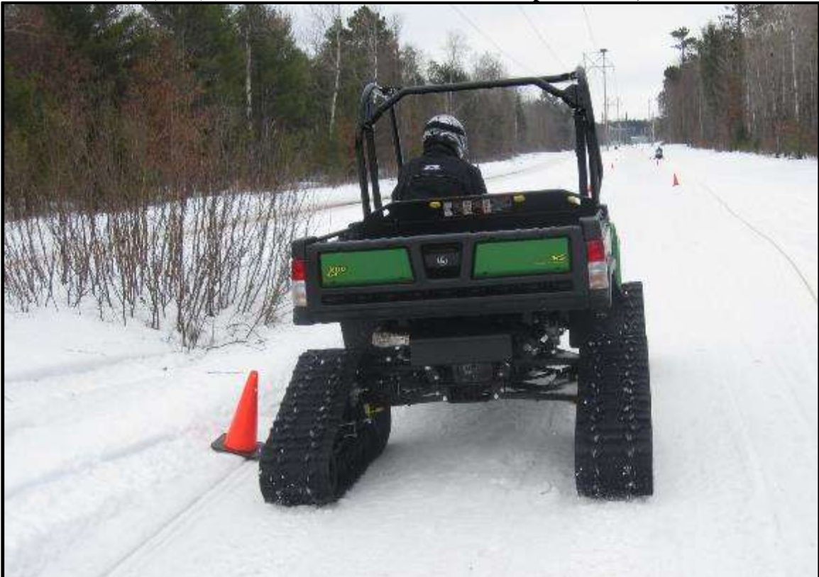
Photo 10: OHV 3 (UTV) – John Deere Gator 825i with Camoplast tracks, rear view