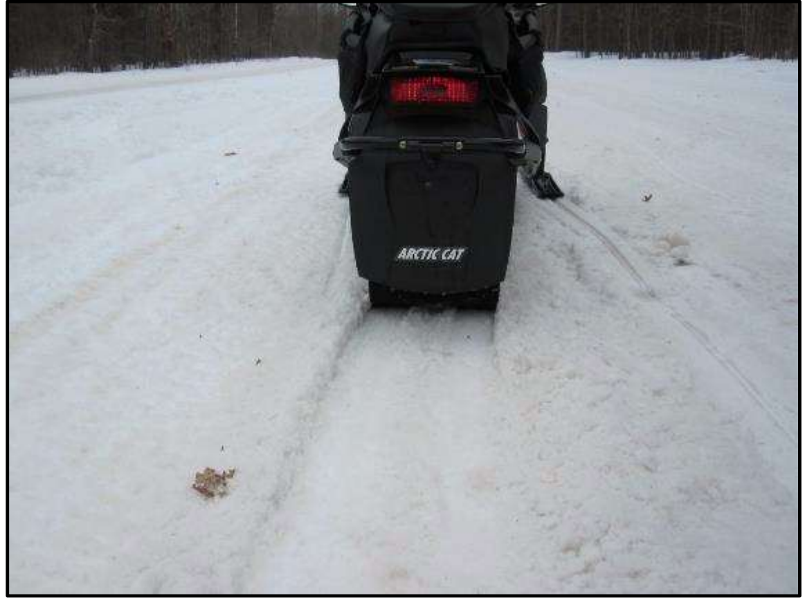
Photo 17: Snowmobile 2 (Arctic Cat T570) impressions from aggressive stop