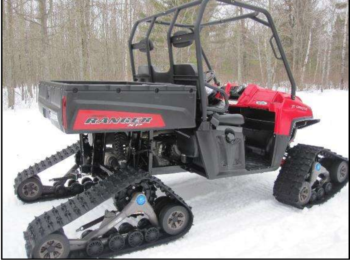
Photo 8: OHV 2 (UTV) – Polaris Ranger 700 with Camoplast tracks, side view