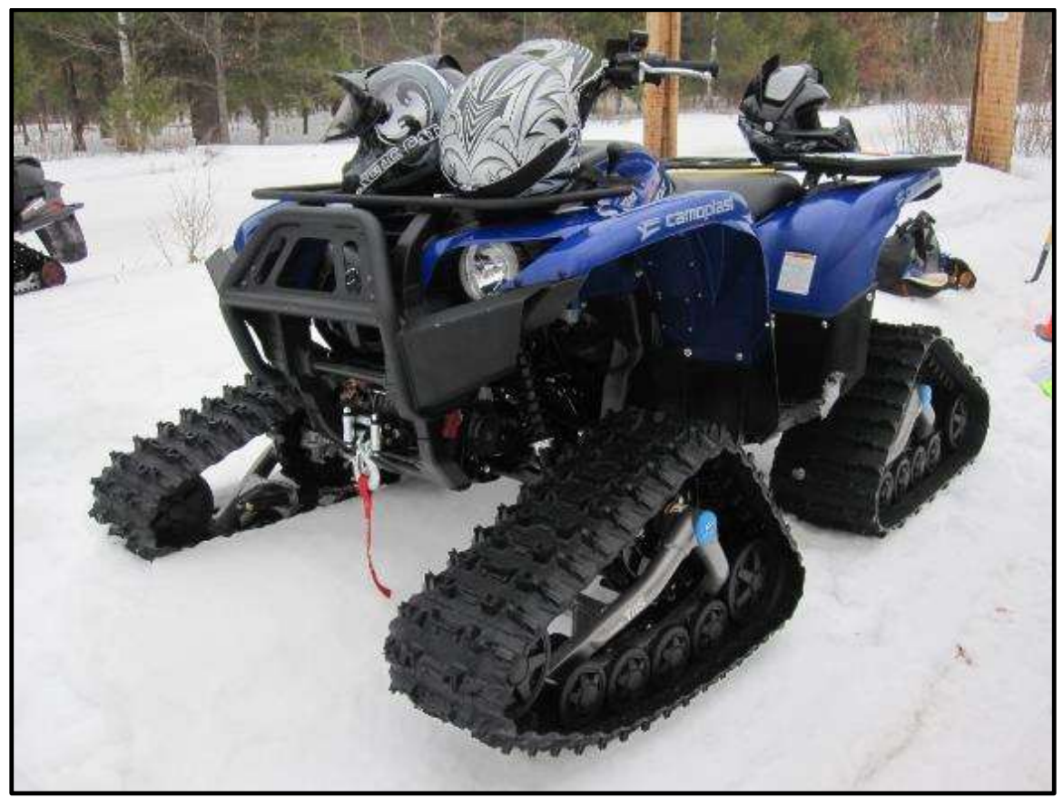
Photo 5: OHV 1 (ATV) Yamaha Grizzly 700 with Camoplast tracks, front view