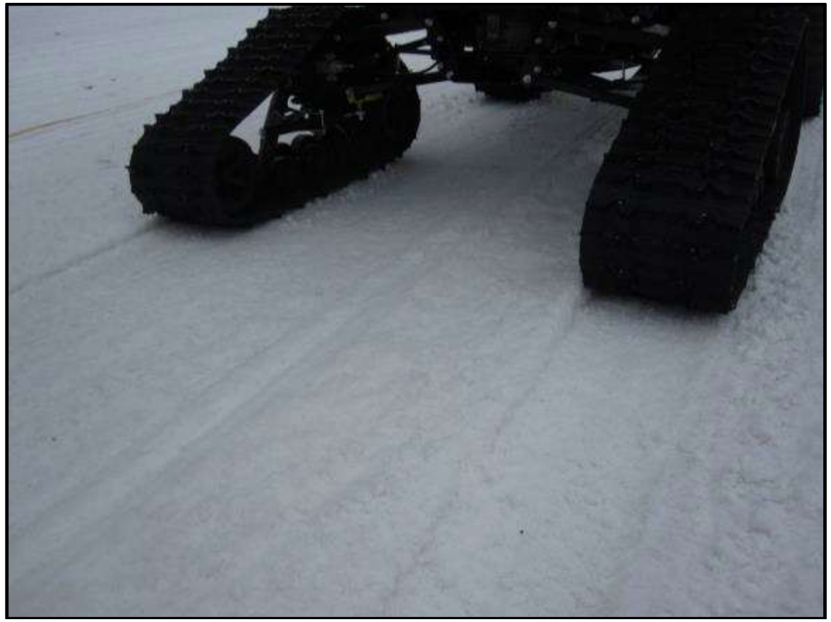
Photo 20: OHV 3 (John Deere Gator 825 UTV) impressions from aggressive stop