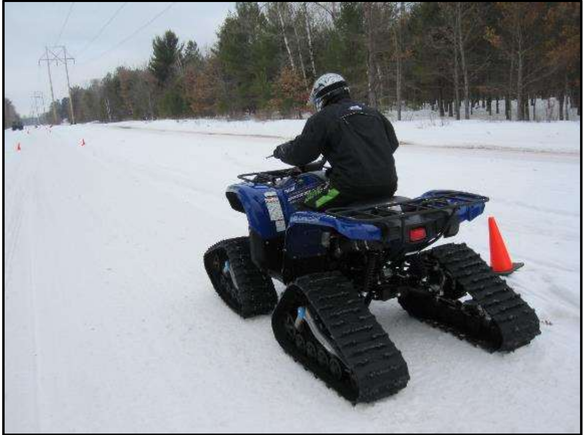
Photo 6: OHV 1 (ATV) Yamaha Grizzly 700 with Camoplast tracks, rear view