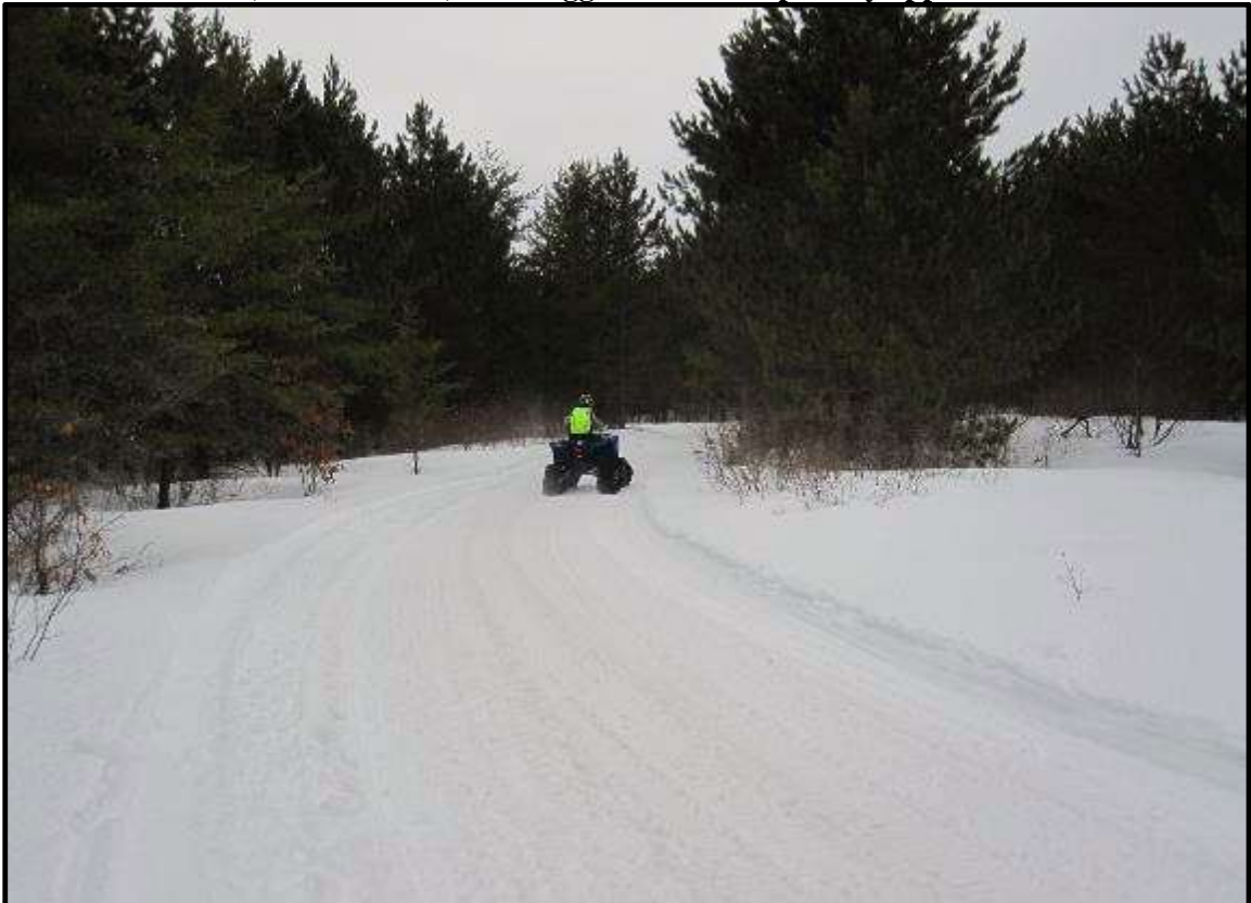
Photo 23: OHV 1 (Yamaha ATV) – fast/aggressive curve pass-by at site #2