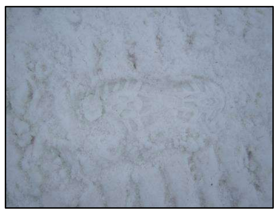
Photo 21: A footprint impression on the trail surface during 2014 test

Footprints: It was noted during 2006 testing that the observer (Kim Raap/Trails Work Consulting) taking measurements of vehicle impressions left boot impressions on the trail that were 2 to 5 centimeters (0.8 to 2 inches) deep. Similarly, footprints from the same observer ranged from 3 to 5 centimeters (1.2 to 2 inches) deep on the trail during 2014 testing, which occurred in warmer weather.