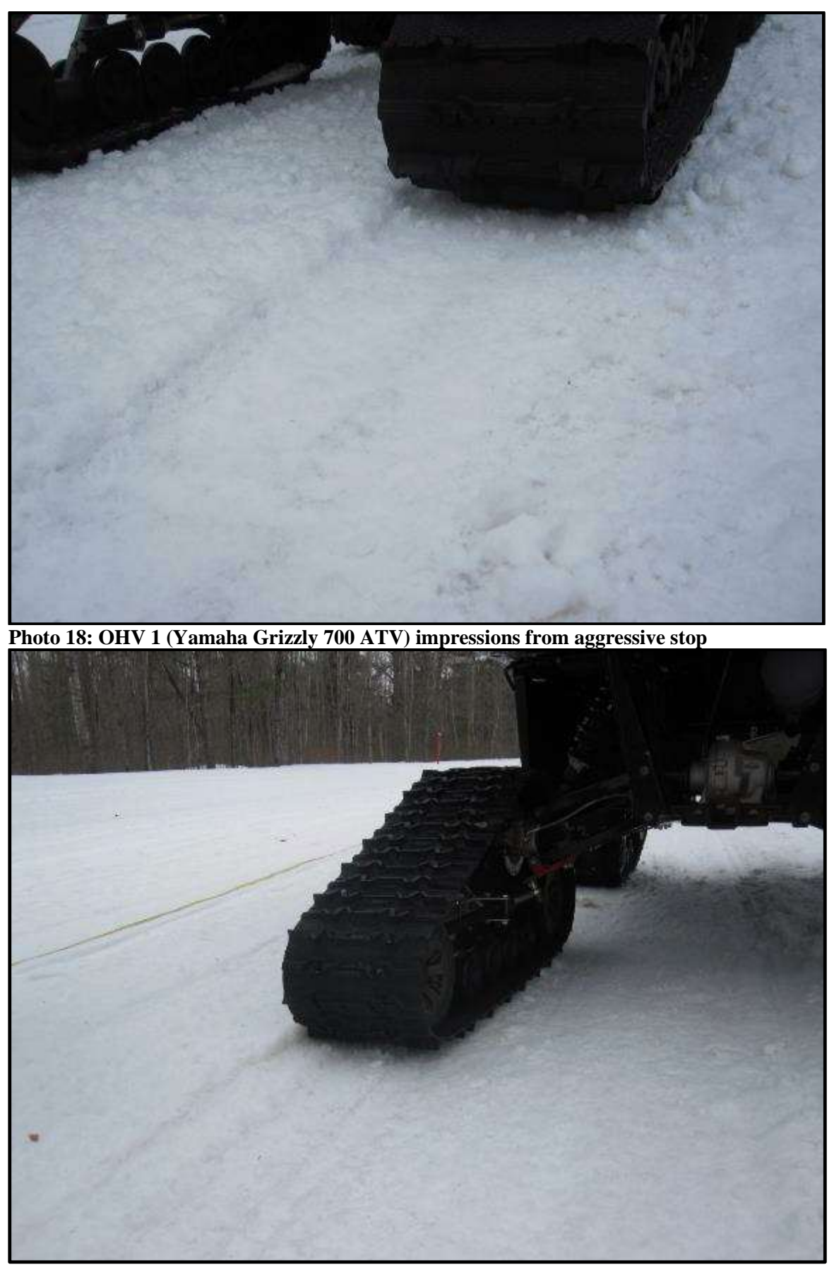
Photo 19: OHV 2 (Polaris Ranger 700 UTV) impressions from aggressive stop