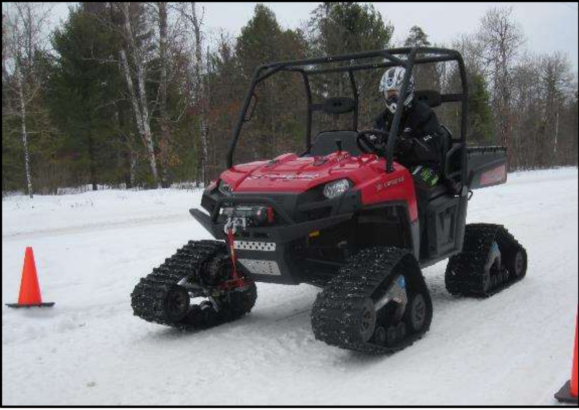
Photo 7: OHV 2 (UTV) – Polaris Ranger 700 with Camoplast tracks, front view