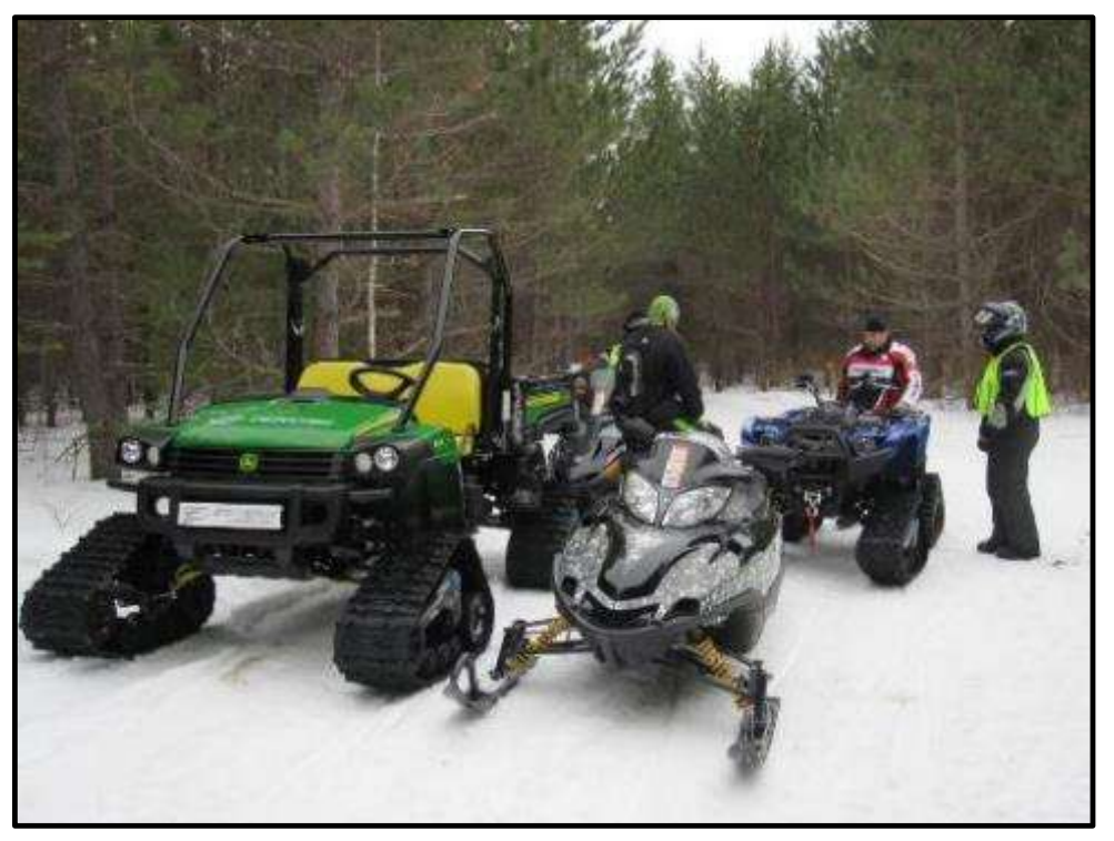
Photo 29: Tracked UTVs are significantly taller than snowmobiles and ATVs

Nonetheless the visual presence of a guy wire across the trail – even after realizing there was sufficient clearance above the UTV caused me to continue shying away from this perceived obstruction while operating taller UTVs along this route. Their extra height definitely intensified a need to watch for potential overhead obstructions.