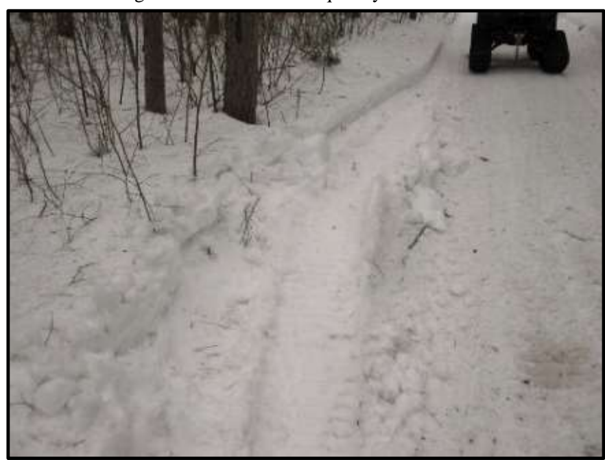
Photo 28: Tracked OHVs were able to operate okay with one track off the compacted trail base

track was steered onto uncompacted snow beside the trail, the UTV became stuck since its front tracks were not engaged. When this happened and the 'all-wheel drive' function was manually engaged, the vehicle could easily become unstuck by effortlessly backing up onto the trail. When both UTVs were operated with their 'all-wheel drive' function engaged, no problems were encountered when they were driven onto uncompacted snow beside the trail; they did not become stuck like when operated in only 2-wheel (rear) drive mode.