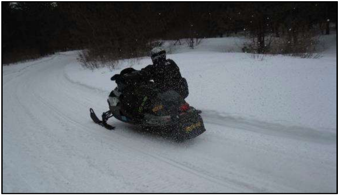
Photo 26: Snowmobile 1 (Fire Cat 500) – fast/aggressive curve pass-by at site #2

Even though all 2006 testing occurred below +32 F and the single 2014 test occurred above +40 F – meaning different results could have conceivably been observed during both tests if temperatures had been flipped – it's worthwhile to compare 2006 observations with 2014 observations since: (1) the two 2006 'control' snowmobiles had more aggressive tracks (1.25-inch and 2-inch track lugs) compared to a 1-inch lug height on both snowmobiles used for the 2014 test, and (2) it provides a comparison to impacts observed from wheeled ATV operation on groomed snowmobile trails. Table 3-4 on page 38 summarizes observations for the four 2006 'control' vehicles (two snowmobiles and two ATVs used at all 15 test sites) from which the following comparisons can be made: