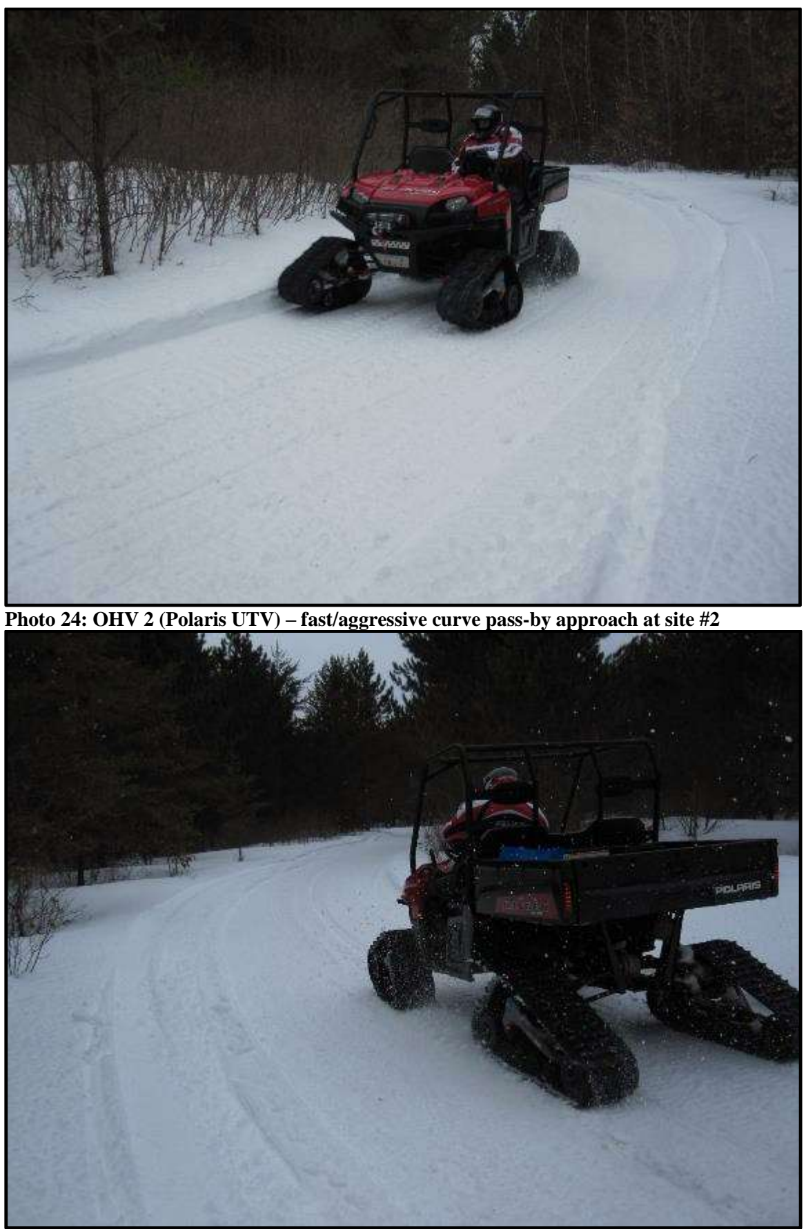
Photo 25: OHV 2 (Polaris UTV) – fast/aggressive curve pass-by at site #2