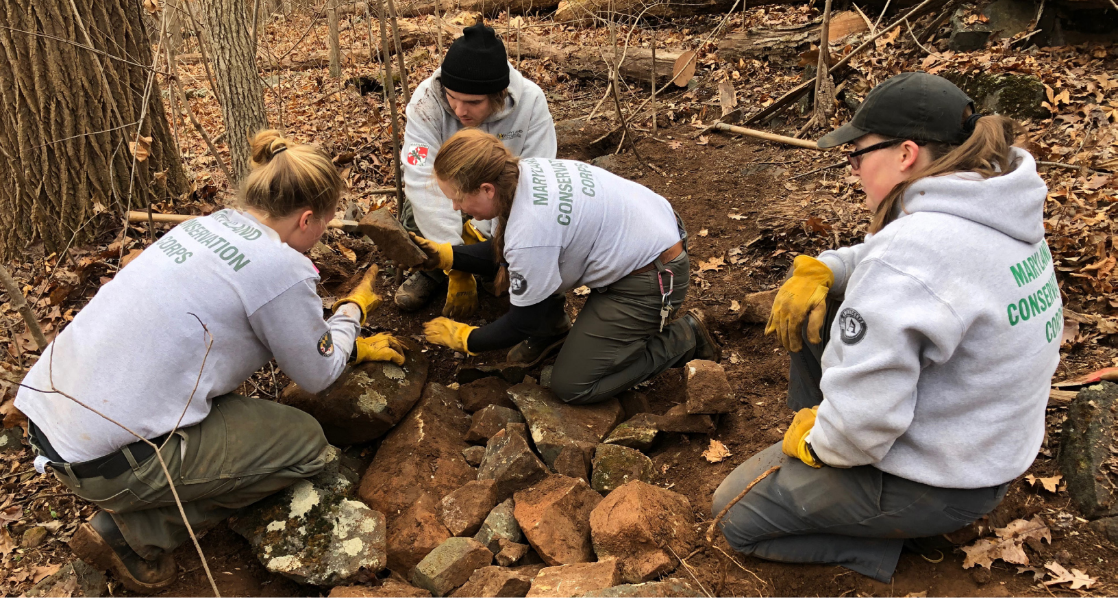
MCC Corpsmembers at work.