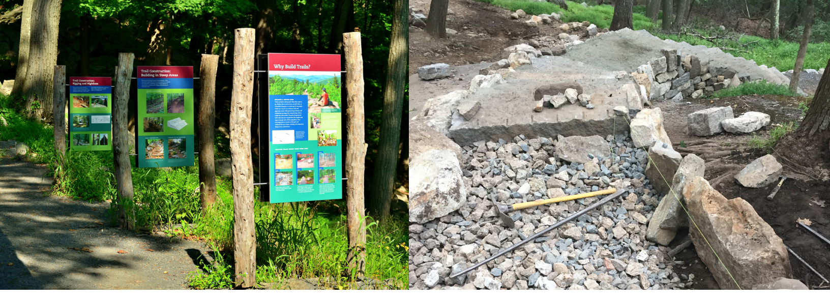
Left: Educational exhibit created by NYNJTC. Right: Rock work on the Bear Mountain Trail.

The Bear Mountain Trails Project could not have been completed without the work of 25 Corpsmembers serving over the last five years. The Corps also enabled thousands of people from the community to contribute to stewarding trails in the Hudson River Valley: NYNJTC crews trained nearly 3,000 volunteers who donated more than 83,000 hours of service. Thousands of community volunteers were engaged on the Bear Mountain Trails Project alone; during one phase of the project, 380 volunteers contributed 3,009 hours of service valued at $58,381.