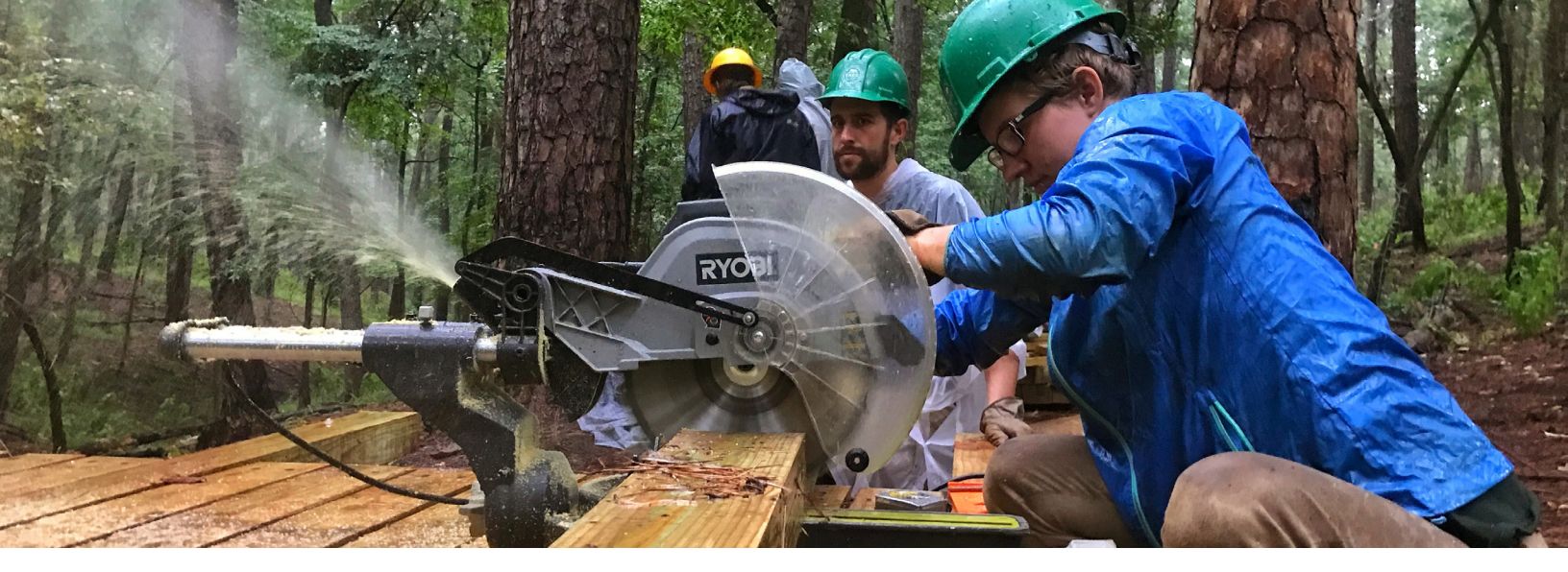
Texas Conservation Corps Corpsmembers cut planks to be used in a bridge.