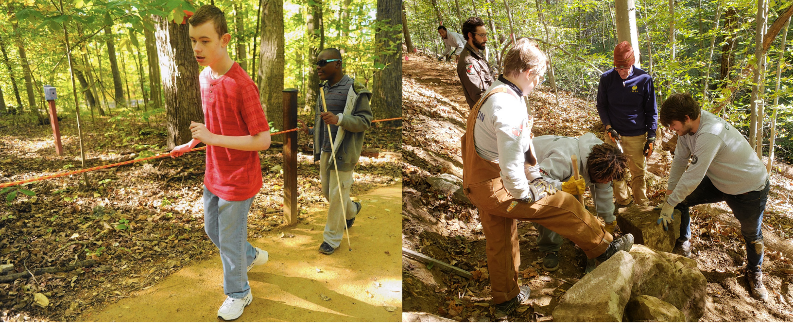
Left: Visitors use a guide rope at the All-Sensory trail; Right: MCC Corpsmembers at work.