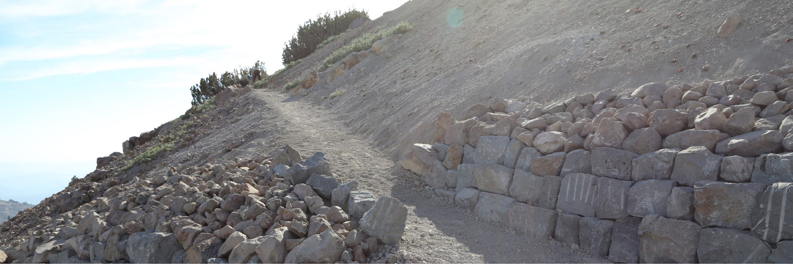
Rock work done by California Conservation Corps Corpsmembers on the Lassen Peak Trail.

The Corpsmembers' work on the trail contributed to the protection and stewardship of endangered vegetation, such as the Lasssen Smelowskia flower, which can only be found in Lassen National Park. Over 1,000 linear feet of the Lassen Peak Trail were rehabilitated, which included widening the trail to allow hikers to safely pass each other, and redefining switchbacks to reduce human impact on the Lassen Smelowskia flower and several other species of rare and endemic alpine plants.