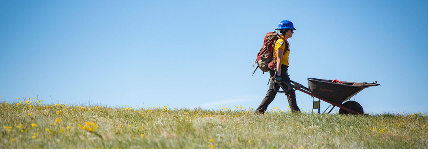
Wyoming Conservation Corps Corpsmember at work on the Pole Mountain project.