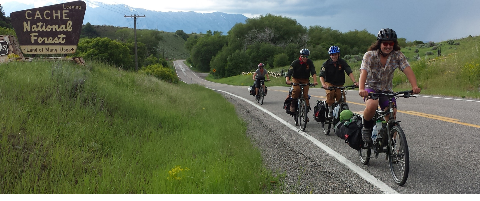
Corpsmembers with Utah Conservation Corps. See page 20.