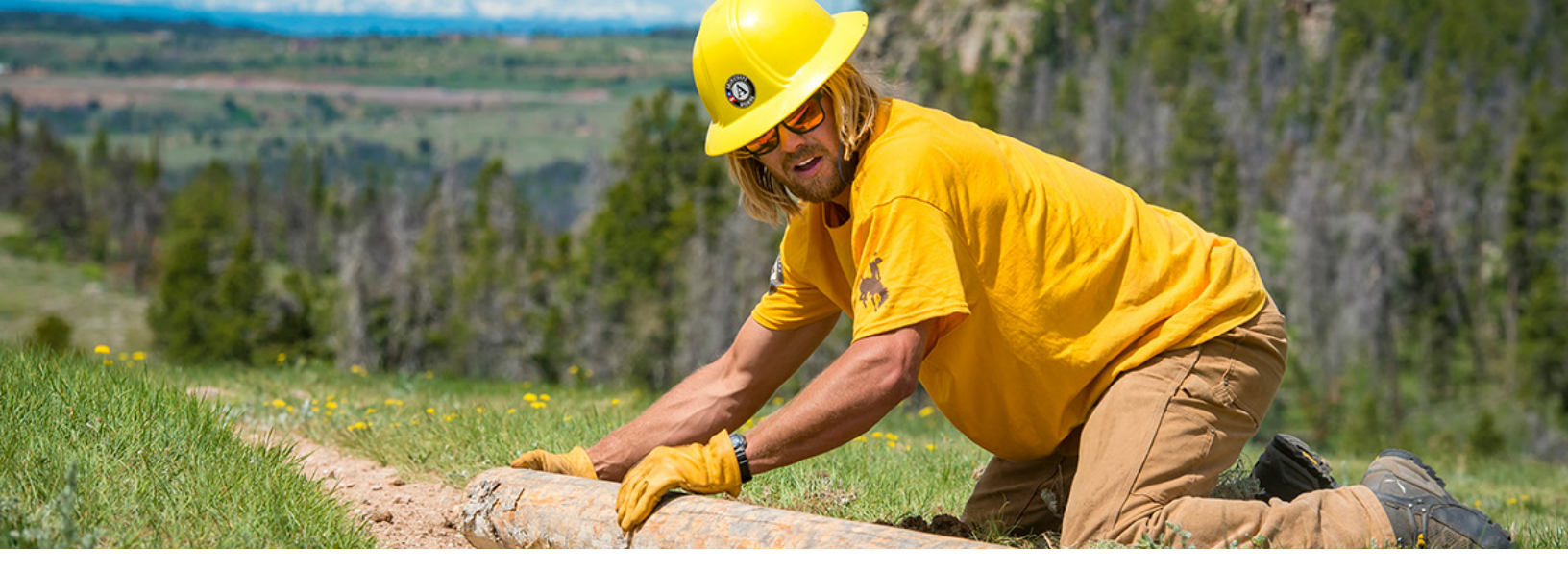
Wyoming Conservation Corps Corpsmember at work on the Pole Mountain project (University of Wyoming).

and Community Engagement Office generated volunteers; local staff from the U.S. Forest Service provided project oversight; and the Wyoming State parks non-motorized trails program provided tools. The development of these rich partnerships will allow this project to grow into a long-term sustainable trail program.