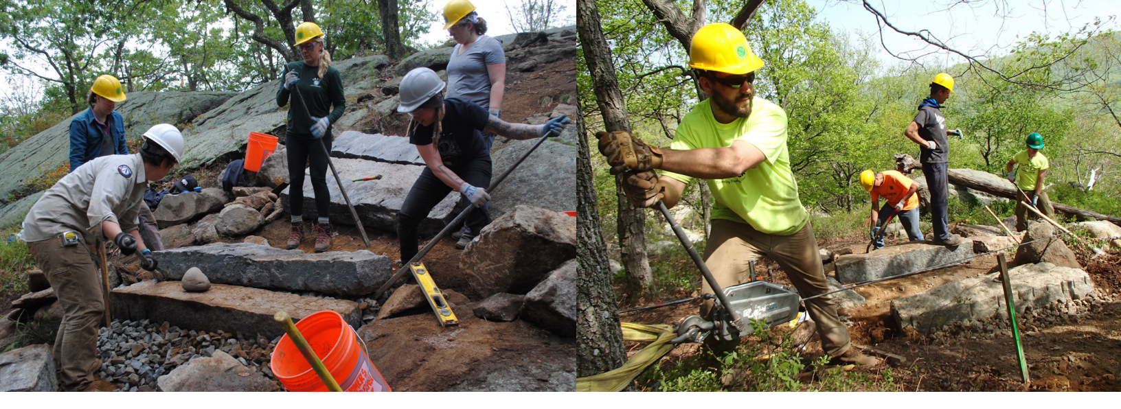
NYNJTC Conservation Corps Corpsmembers at work at Bear Mountain State Park.