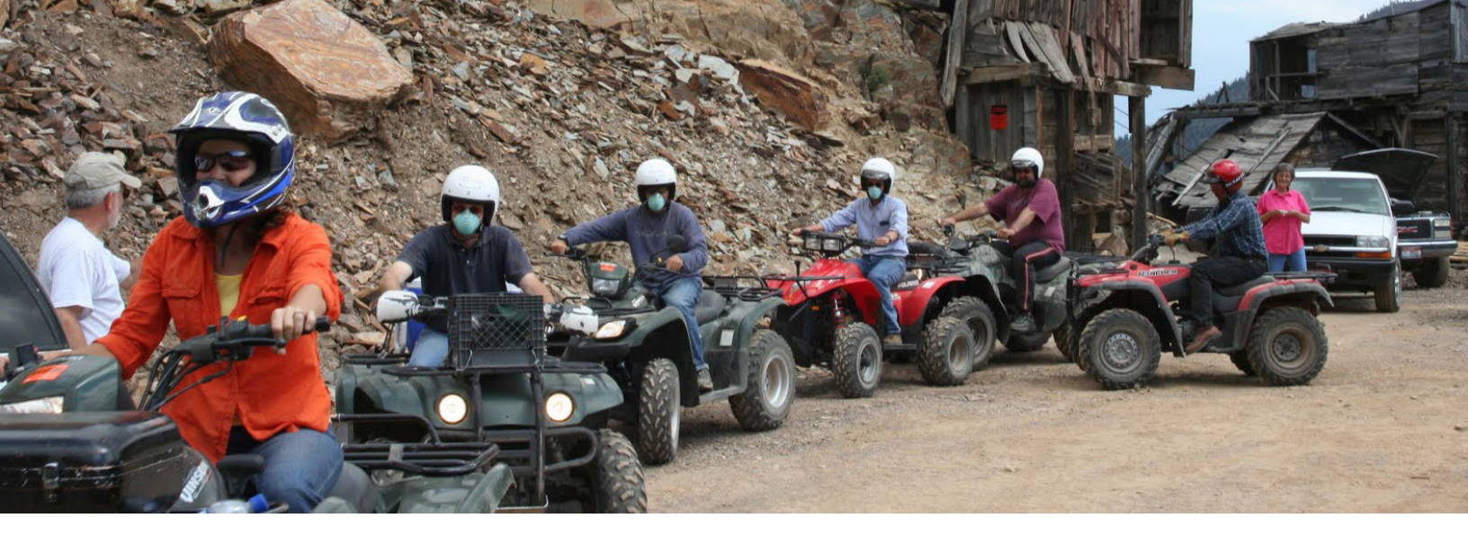
People enjoying the Lombard Trail.