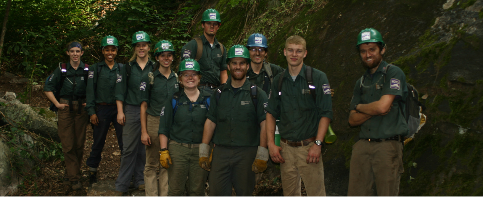
Trail crew from Conservation Corps North Carolina.