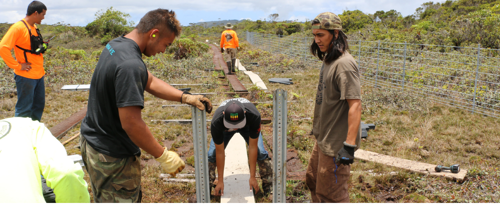
Installing new boardwalk sections on the Alaka'i Swamp Trail.