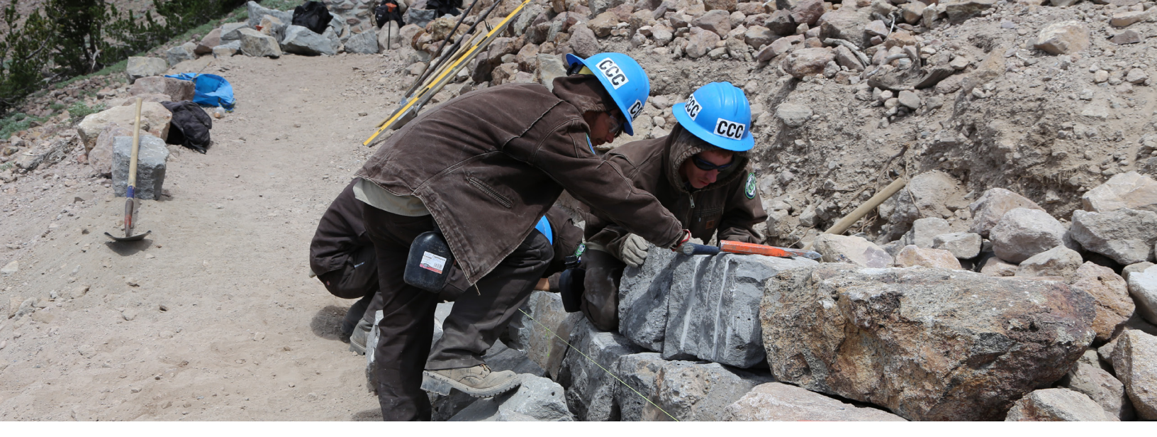
California Conservation Corps Corpsmembers serving on the Lassen Peak Trail.