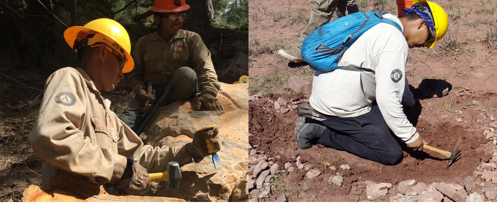
Left: Mogollon Rim project; Right: Zuni Mountains project.