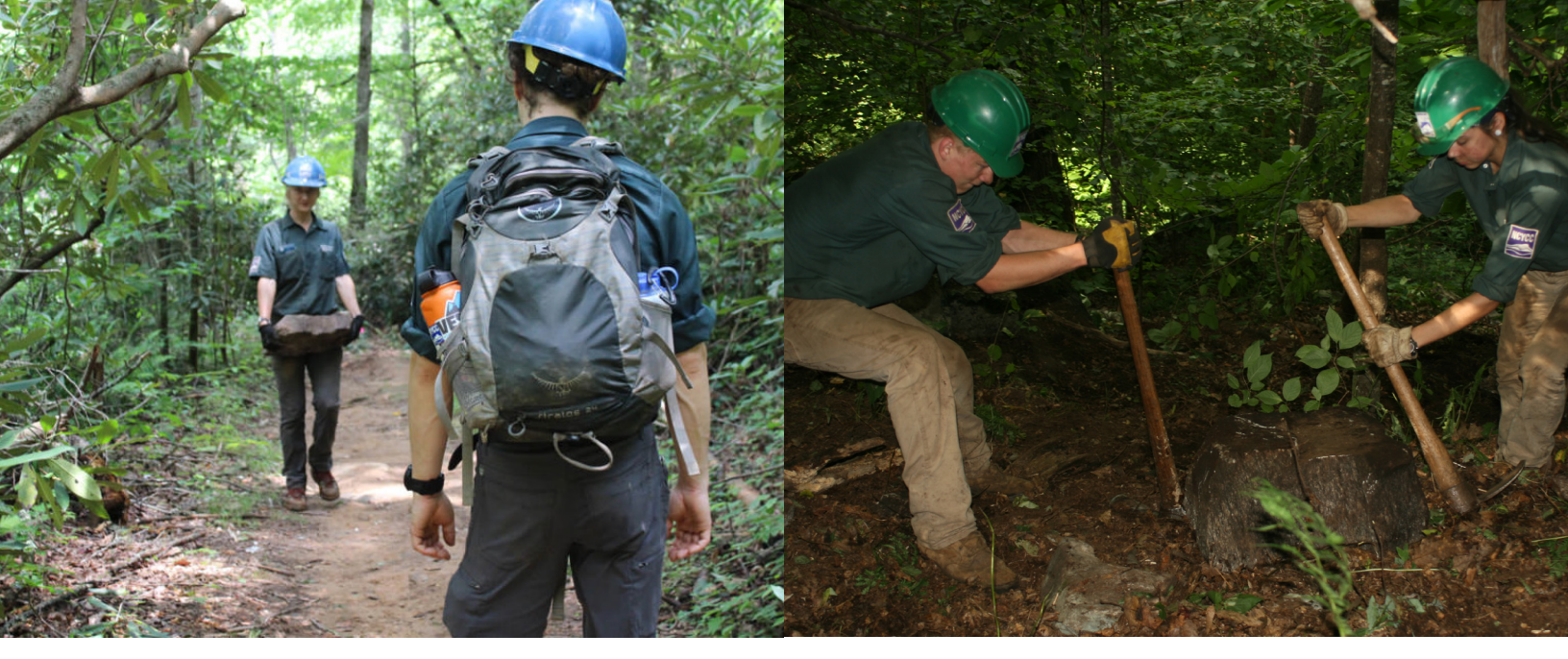
Trail crews from Conservation Corps North Carolina.

ACE collaborated with NC High Peaks Trail Association (NCHPTA), the U.S. Forest Service, and Mt. Mitchell State Park. NC High Peaks Trail Association received the grant and contracted ACE to conduct the labor. NCHPTA approved plans with the U.S. Forest Service and did pre-planning involving ACE and the Forest Service. Mt. Mitchell State Park Staff helped provide access to the trail, a camping location, and logistical support with ATVs or trucks to help the crew pack in gear.