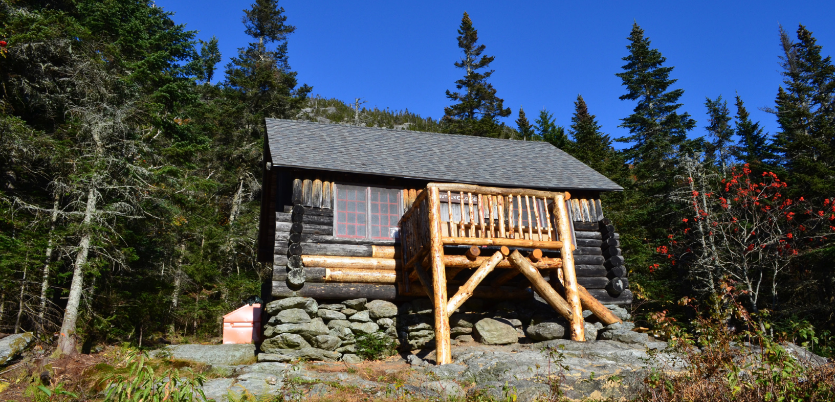
The historic Butler Lodge along the Long Trail in Vermont.

the land used for the airlift and a portion of the trail. The GMC provided on-the-ground work supported financially through the club's resources and state contributions. Additional funding sources included GMC membership fees, private donations, and in-kind labor donations.