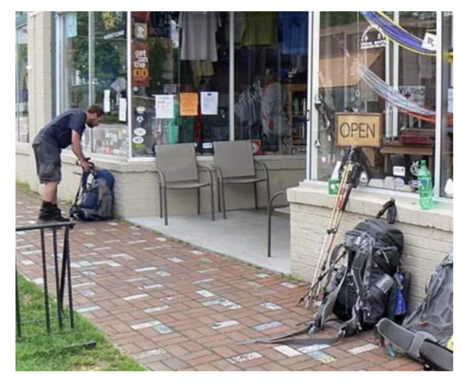
The Harbinger Consultancy <u>Tell the Economic Story of Your</u> <u>Conserved Lands and Trails Without</u> <u>Hiring an Economist (June 2023)</u>

While a tremendous body of studies has substantiated the economic value of trails, it's most compelling to speak directly about the benefits of your program, your locally conserved lands, your trails.