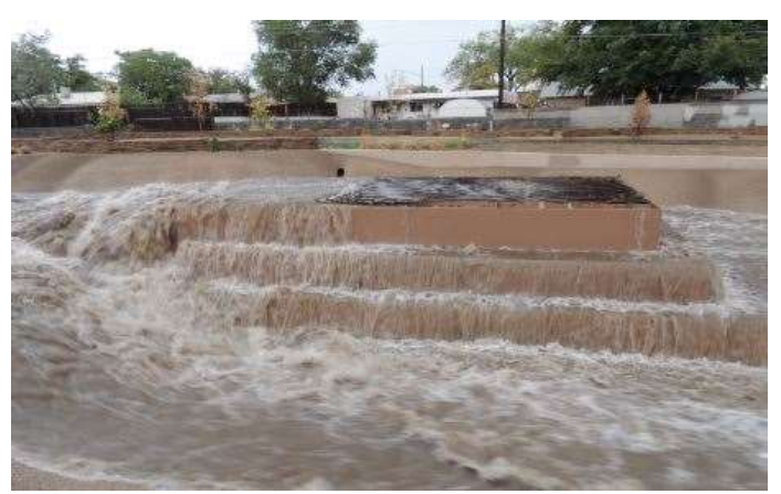
In-stream filtering structure at work during a June 2013 storm

An in-channel water quality structure and underground cisterns manage the Hahn Arroyo's stormwater, removing pollutants and cleaning stormwater water before it enters the Rio Grande. In addition to filtering and controlling floodwaters in times of abundance, the cisterns store water for irrigation. The water harvesting system is used for irrigating the trees, shrubs, and grass areas of the project, as well as irrigating