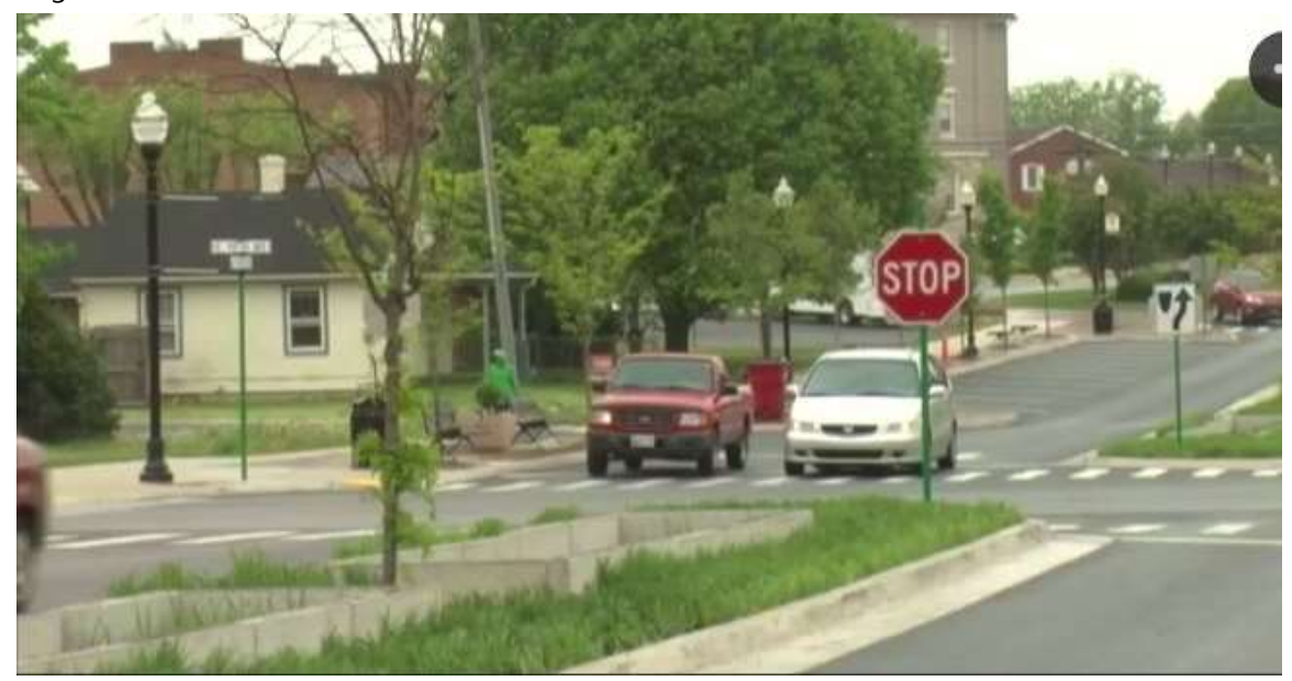
Median bioswales capture and filter stormwater runoff.

Just over an hour from the Washington, D.C. metro area, Ranson and Charles Town, WV, are a model of planning collaboration. "Two Cities, One Revitilization Plan"<sup>3</sup> was the community mantra as the neighboring towns looked to transform their shared autocentric arterial, Fairfax Boulevard, into a green street and their abandoned industrial brownfields into a renewed commerce corridor. A HUD Community Challenge grant provided funding and assitance for the new Ranson "Smart Code" and land use plan, while research and remediation for former industrial sites came from a Brownfields Area-wide Planning grant from the EPA. Construction of the Green Corridor—a two-mile stretch of Fairfax Boulevard in Ranson and George Street in Charles Town—was funded by DOT TIGER II and IV grants.