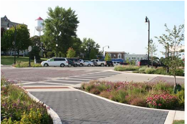
Bioswales were added into the bulbouts at each major intersection in downtown.

Located in northeastern Iowa, West Union, with a population of 2,500, experienced deterioration inits downtown streets, sidewalks, and public areas. So when it was approached by the Iowa Economic Development Authority (IEDA) about a Green Streets Pilot Program, the small town commited to and ultimately implemented one of the most sustainble downtown revitalization projects in the country. The Town and IEDA were the initiating partners, and before the end of the project, $7.5 million had been granted or donated by 17 outside Federal, State, and local sources.