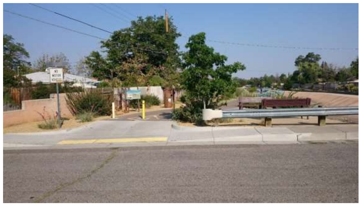
One of many bike and pedestrian entrances to the Hahn Arroyo Trail

To complement the stormwater sustainability measures, the project repurposed site materials by using the old concrete channel lining to create benches along the trail. Additionally, the trail is lined with native grasses and trees to encourage ecological restoration and wildlife activity similar to a natural stream.