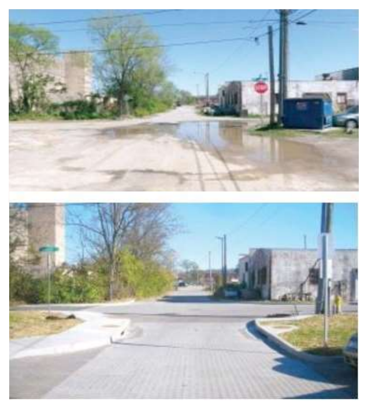
Johnson Street before (top) and after (bottom)

This shared street is an application of design flexibility that meets the needs of all users, while doubling as stormwater management, capturing the first inch of runoff during storm events and eliminating nuisance flooding. After completion, the project won the Tennessee Governor's Environmental Stewardship Award for Excellence in Green Building as well as a Chattanooga Low Impact Development Excellence Award.