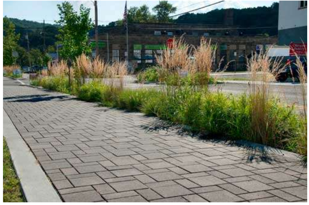
Permeable pavers and bioswales improve stormwater management.

Ohiopyle Borough in western Pennsylvania has under 100 residents, but over 1.4 million annual visitors who come to visit Ohiopyle State Park and nearby attractions such as Frank Lloyd Wright's Fallingwater and Kentuck Knob. Ohiopyle prides itself as a sustainable community and in 2009 it partnered with the Pennsylvania Environmental Council (PEC) to prepare the Joint Master Plan and Implementation Stretegy for both the Borough and the State Park. This plan was inspired by the larger Laurel Highlands Conservation Landscape Initiative steered by the Pennsylvania Department of Conservation and Natural Resources (DCNR) and marked the first time that the DCNR jointly prepared a plan with a municipality. The planning effort led directly to the Ohiopyle Green Streets Project, which greatly improved pedestrian connectivity and stormwater management along three streets near the Visitor's Center and primary commercial establishments.