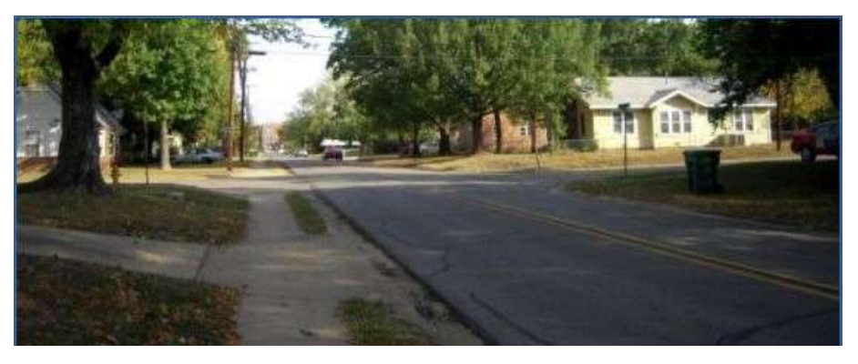
North El Paso Avenue before (top) and after (bottom) project.

The Public Works Department had to be flexible while implementing and funding this project. During construction, the city discovered that the corridor, a former State highway, still had a massive concrete slab embedded beneath the roadway. This required modification of the original concept—a single two-way buffered bike path—to retain the existing centerline and instead implement two, one-way protected bike lanes on either side of the road. To pay for the project the City used a loan, which they then repaid using the special 10-year, statewide <sup>1</sup>/<sub>2</sub> cent sales tax, dedicated to highway improvements and approved by Arkansas voters in 2011.