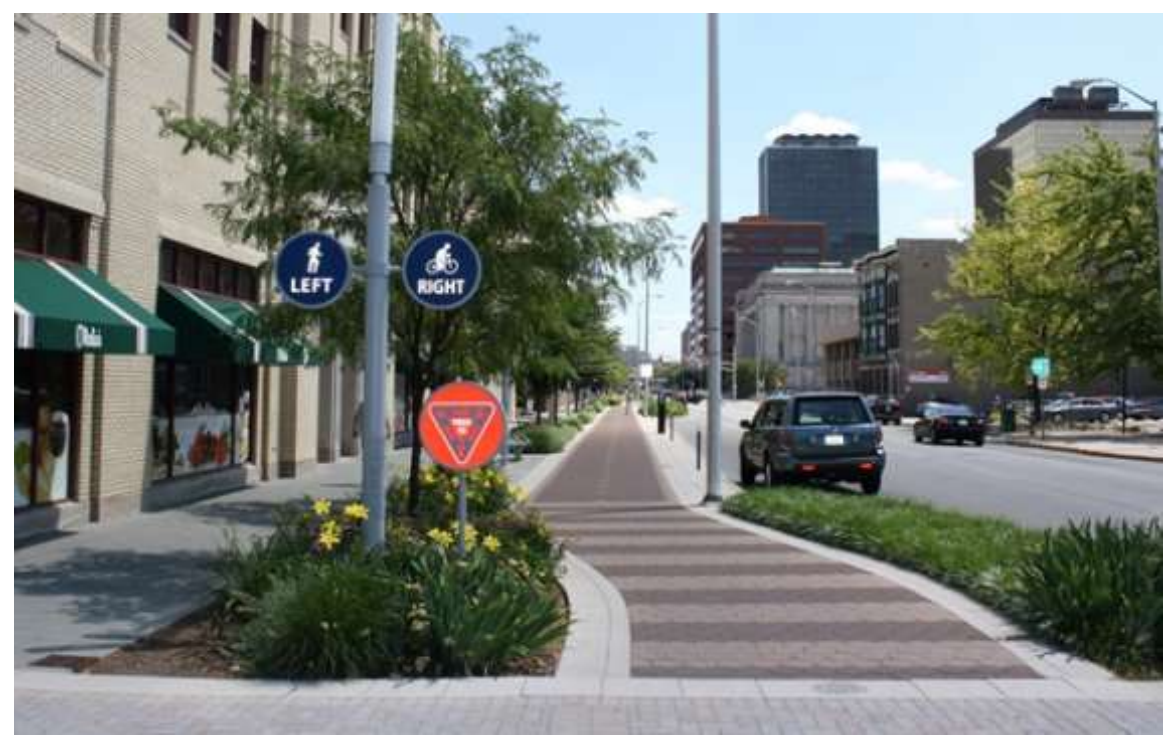
Bioswales and planters are incorporated throughout the trail medians.

raised a total of $27.5 million in private donations, nearly matching the $35.5 million in Federal transportation funds, including TIGER funds, granted over a period of several years and funding cycles. All elements of the trail, including the green space and pathways, are managed by a nonprofit called Indianapolis Cultural Trail, Inc.