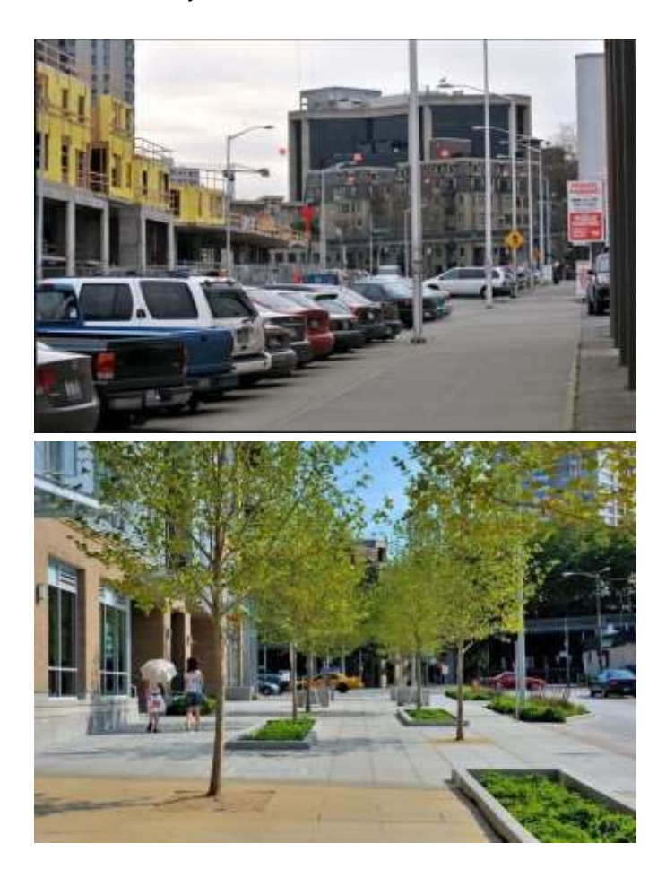
Taylor Avenue North before (top) and after (bottom) the project

All Taylor Street improvements were paid for by the developer, as it was determined that the added upfront costs would be offset by the long-term water savings for the development. As a result, the public right-of-way was redesigned to provide more safe and inviting public space with limited costs to the city.