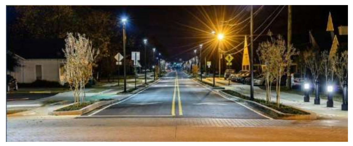
North El Paso Avenue is now safer at all hours of the day for pedestrian and cyclists.

As one in a set of complete streets projects planned for Russellville, AR, the North El Paso Corridor now provides an essential bike and pedestrian connection between downtown Russellville and the Arkansas Tech University campus. The <sup>3</sup>/<sub>4</sub>-mile roadway was identified in the 2011 Downtown Master Plan as a "key connection" for active transporation, and now includes pedestrian-scale streelights, buffered bike lanes, and new ADA-compliant sidewalks on both sides of the street.