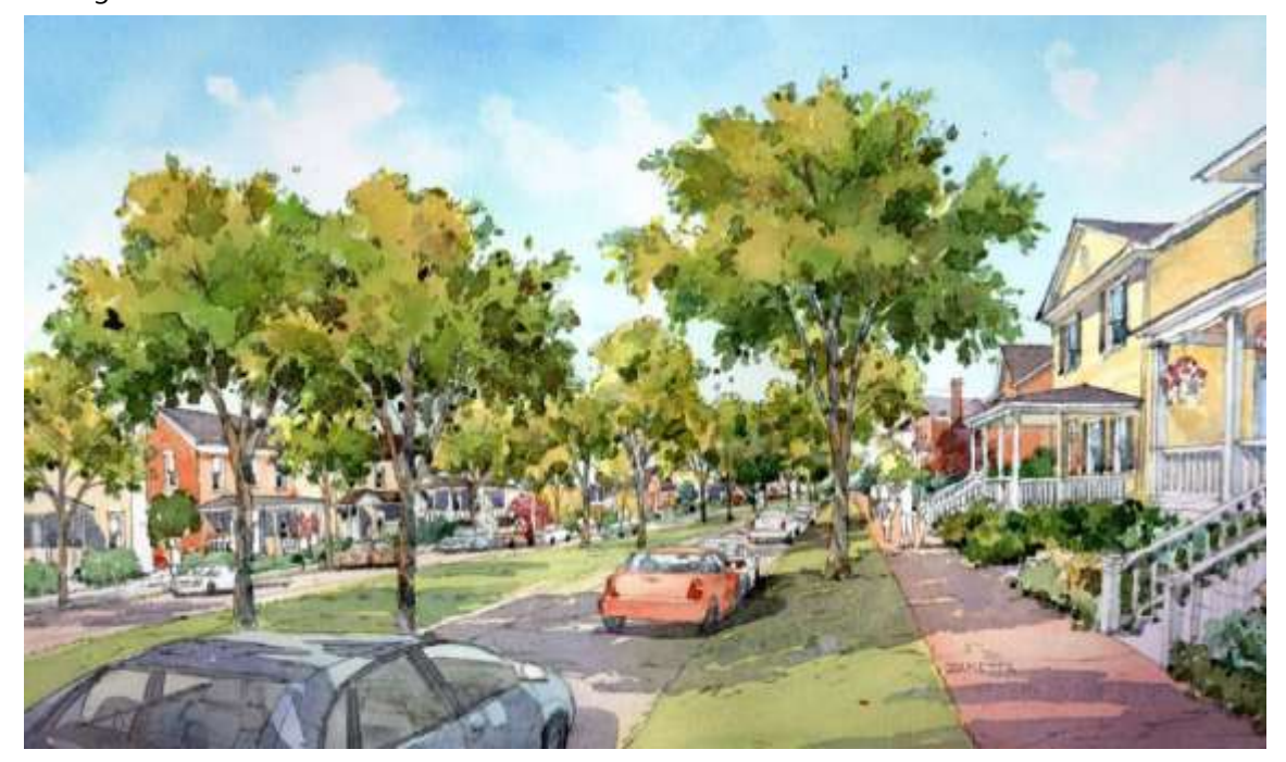
An artist's rendition of the Fairfax Boulevard redesign

Stormwater treatment includes a landscaped median with bioswales designed to capture, treat, and inflitrate runoff through soils and plants, including 2,000 new street trees and shrubs. A conveyance system drains excess water from large storm events into a retention pond developed on adjacent, formerly industrial land. Soils excavated from the corridor project were used to cap the former foundry site. These measures respond to new, more stringent, water quality standards for communities in the Chesapeake Bay watershed. Inflitration was particularily important for this site in order to reduce the acidity of stormwater, which can slowly dissolve the limestone geology of the region and lead to sinkholes.