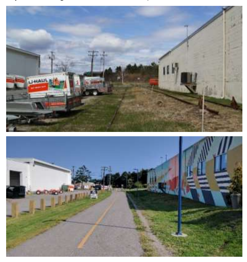
The former railroad right-ofway (top) transformed into the multi-use Bayside Trail (below).

To address contamination and stormwater runoff, the trail uses pervious pavement and incorporates landscaped bioswales and retention beds along the right-of-way adjacent to the trail. Green infrastructure along the corridor is estimated to reduce stormwater runoff by 10 to 20 percent. These efforts were funded by a combination of $800,000 in Federal funding, $1.6 million in private funding, and $3.5 million from the City to both purchase the property and fund construction costs. Gradually the completed trail gained users and helped to reinvigorate the Bayside housing and mixed-use development markets.