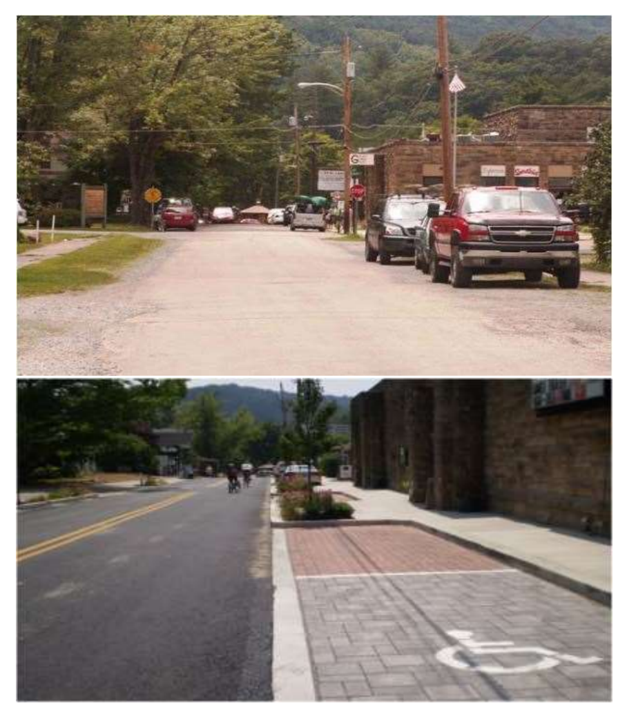
Sherman Street before (top) and after (bottom) project

These stormwater improvements were paired with a more pedestrian-friendly roadway crosssection that included ADA compliant sidewalks and a multiuse path connecting all major tourist destinations in town. This project was completed with $1.3 million American Reinvestment and Recovery Act Green Project Reserve grant through the Pennsylvania Infrastructure Investment Authority (Penn VEST).