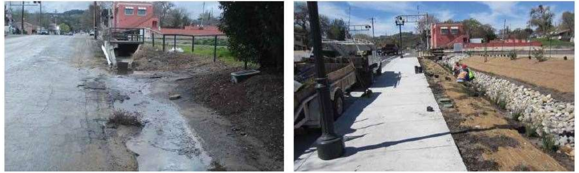
21st Street looking east before (left) and after (right) redesign

The project received two prominent awards in 2014: the Green Innovation Award from the Central Coast Chapter of the US Green Building Council and the Transportation Project of the Year from the Central Coast Chapter of the American Public Works Association.