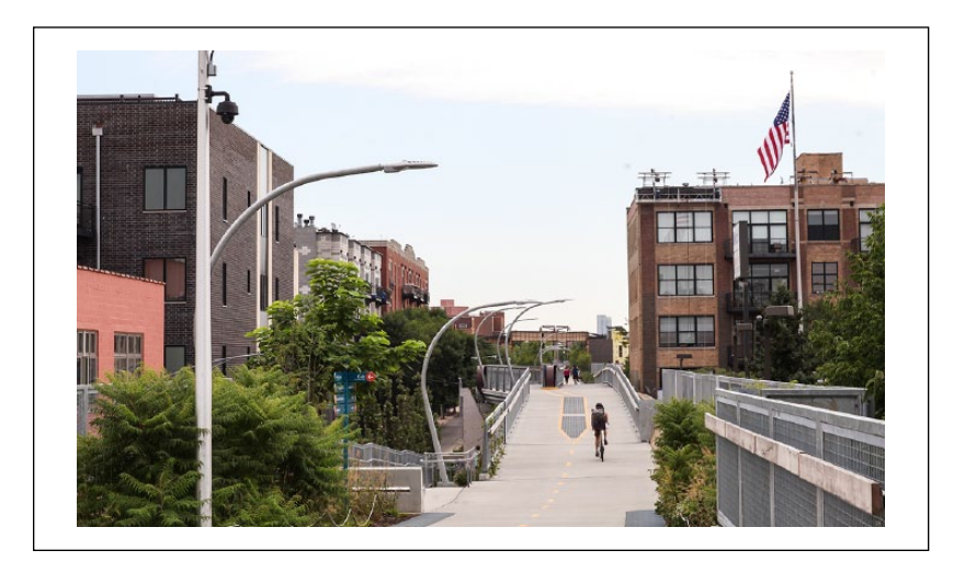
Figure 3. View looking east from the Western Avenue access point located on the Bloomingdale Trail.

Figure 2. View looking east from the Lawndale Avenue access point located on the west end of the Bloomingdale Trail.