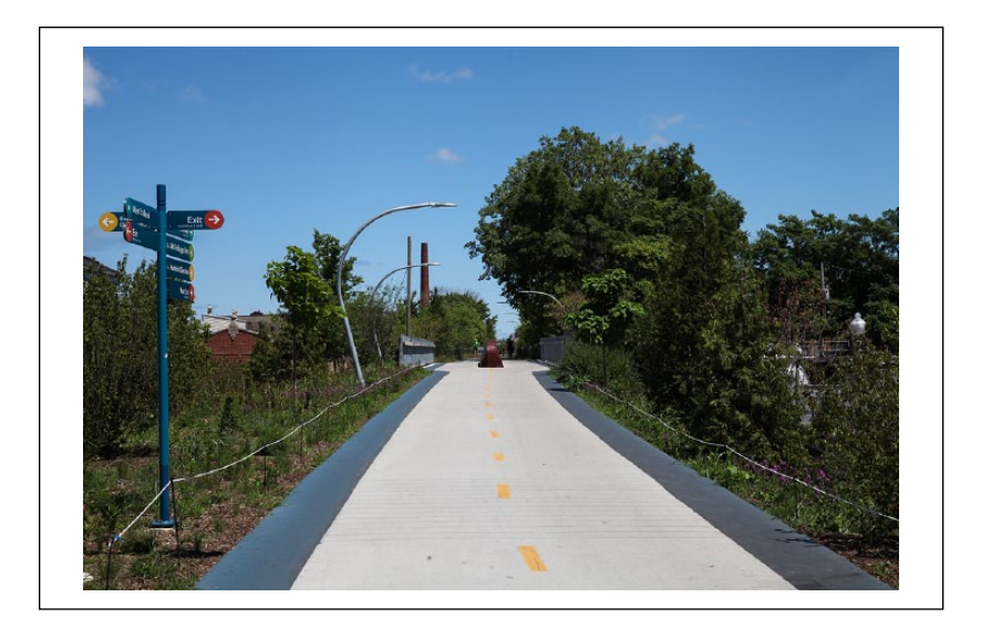
Figure 2. View looking east from the Lawndale Avenue access point located on the west end of the Bloomingdale Trail.