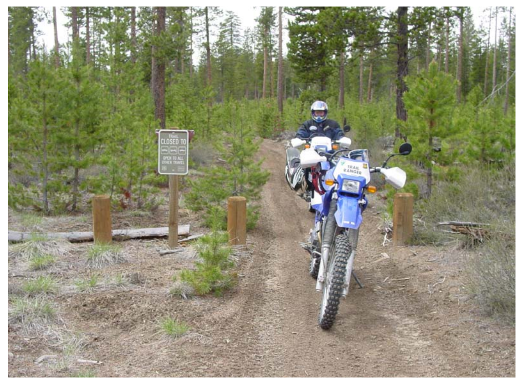
Typical road crossing with bollards, travel management, reassurance, and yield signs.