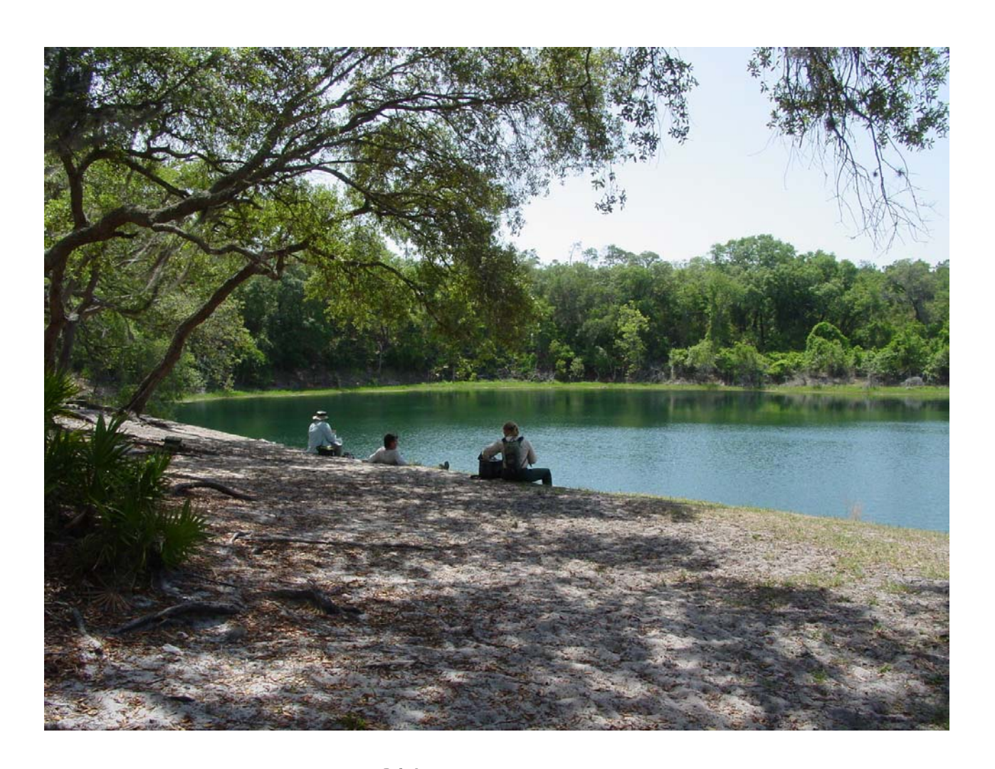
Sign Plan for Motorized Trails