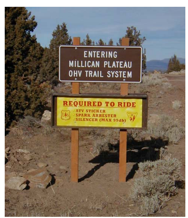
Typical portal signs.