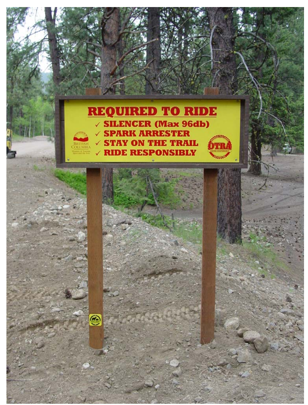
Typical Required to Ride