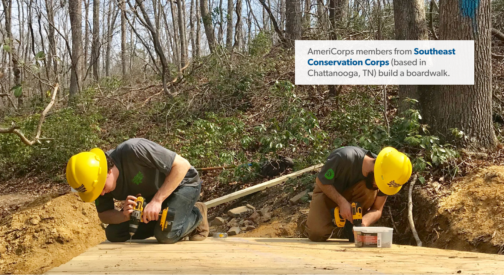
AmeriCorps members from Southeast Conservation Corps (based in Chattanooga, TN) build a boardwalk.