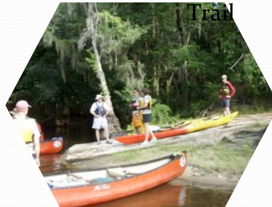
Edisto River Canoe and Kayak Trail