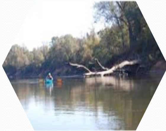
Wateree River Bluetrail