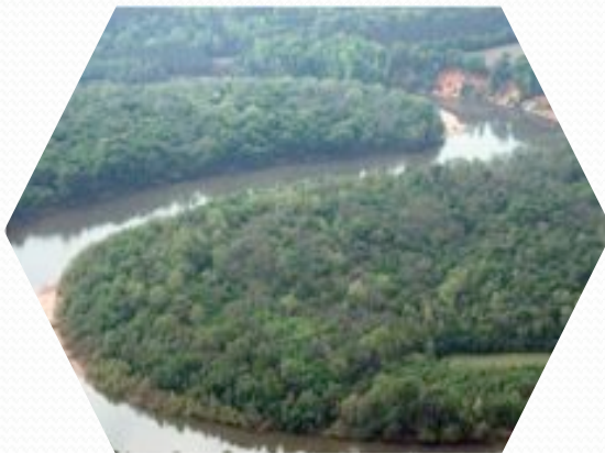
Congaree River Bluetrail