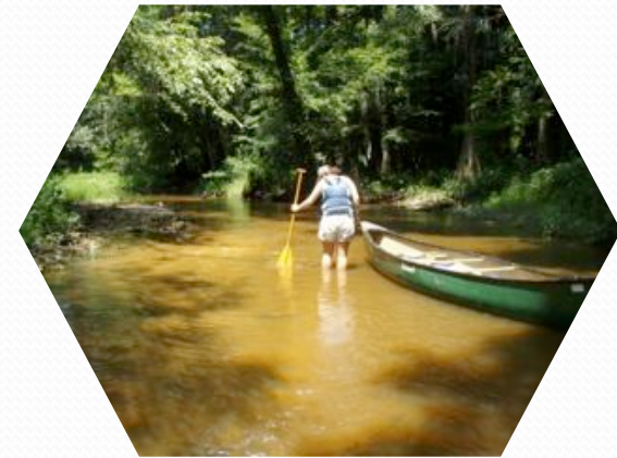
Lynches Scenic River Trail