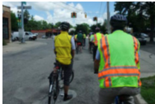
Participants bicycle during the Michigan pilot.