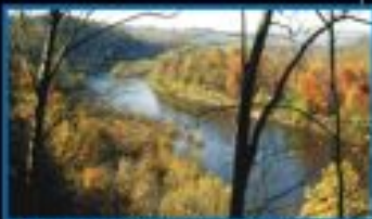
Explore the scenic beauty of Pennsylvania's water gaps, ridges, mountains, valleys and plateaus.