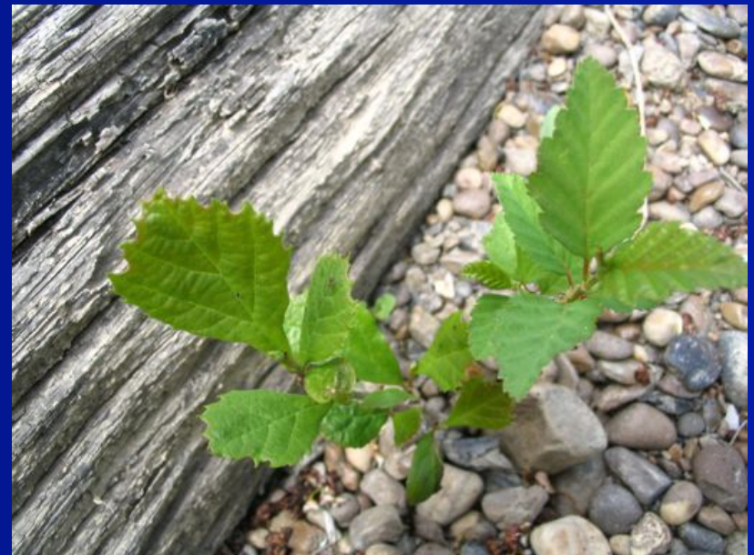
River Birch Sapling

Five brothers camped here July 16 on our way from Sunbury to Marysville. We brought our Dad’s ashes with us and spread them in the river with a small ceremony. We were all raised on this river so it was very fitting. This river is our blood. Life is like a river.”