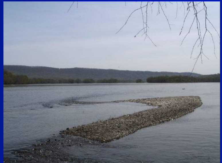
Mahantango Mountain from Island 105