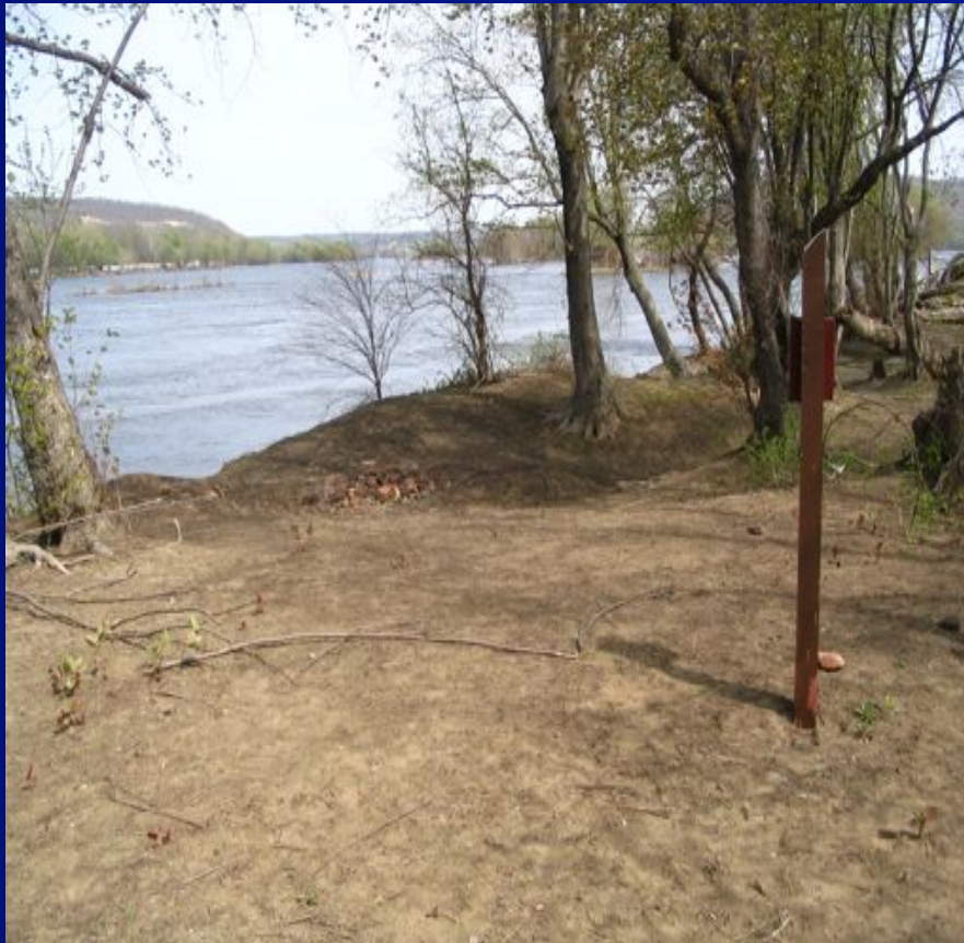
Fire Ring and Clearing