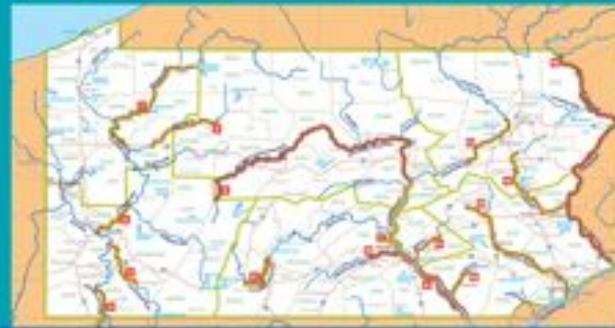
Each water trail is unique, a reflection of Pennsylvania's diverse geology, history, ecology and communities.