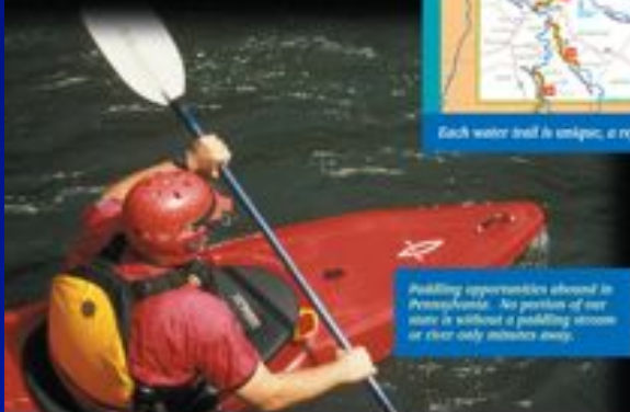
Paddling opportunities abound in Pennsylvania. No portion of our state is without a paddling stream or river only minutes away.