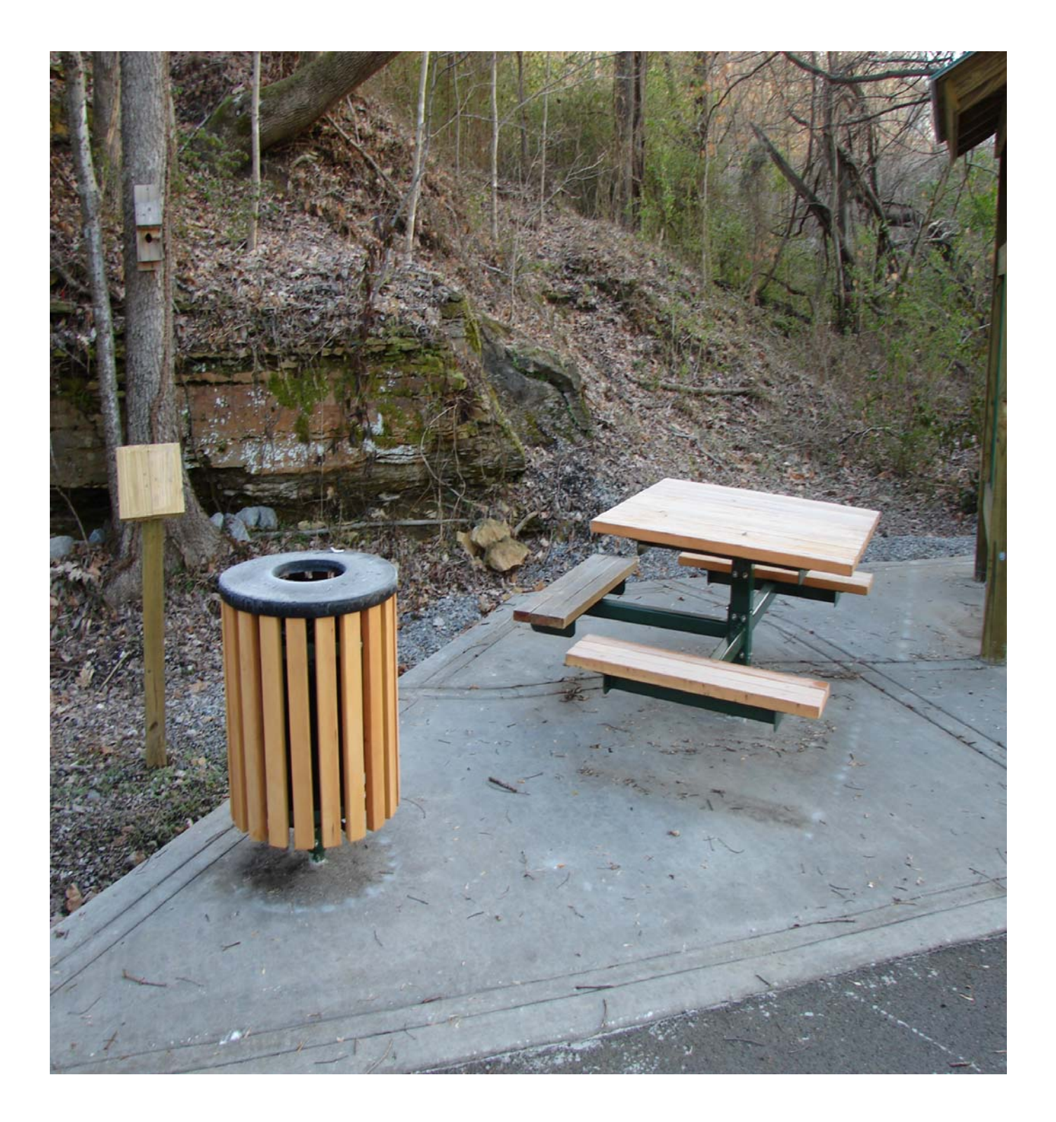
ADA Accessible picnic table and trash can adjacent to the trail