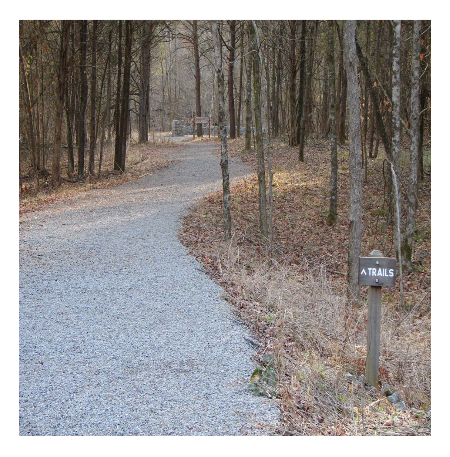
ADA Accessible trail with gravel base and tar and chip surface