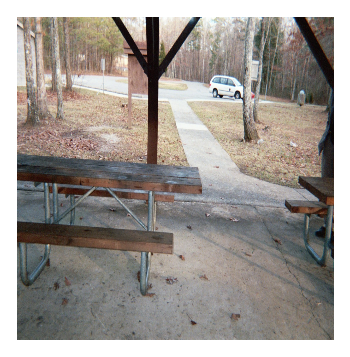
ADA Accessible Picnic Table with connecting path to parking area