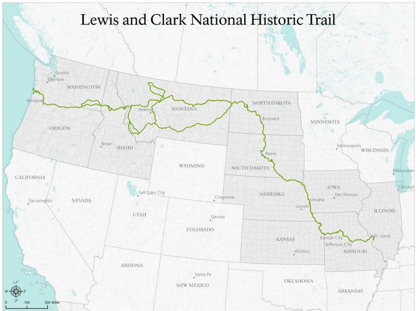
FIGURE 1. LEWIS AND CLARK NATIONAL HISTORIC TRAIL